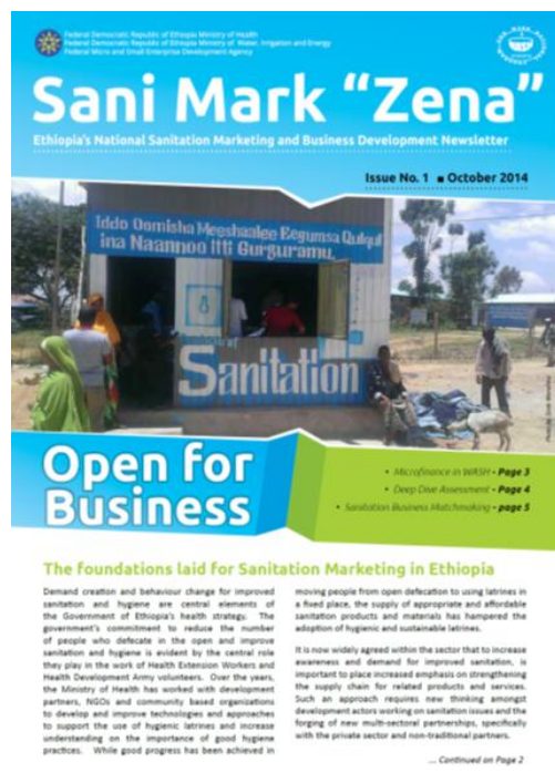
Figure 3: Sani Mark Newsletter Issue No. 1