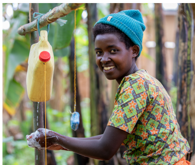
Figure 1. Right: UNICEF's East and Southern Africa context

There are wider critical challenges in the region that hugely impact on progress, and which reinforce, the need for improved WASH services (see Figure 1).