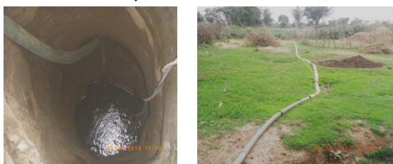
Figure 4. Hybrid well for irrigation (left) and plastic hose leading the water to the farmland (right).

The traditional well is of the hybrid type, with a total depth of 25 m: first 7 m dug by hand and the next 18 m drilled with steel pipes. Water from the well is pumped out with a petrol pump through a long hose to irrigate the family's 1.5 hectares of farmland. The irrigated crops are tomato and onion, with two harvests a year.