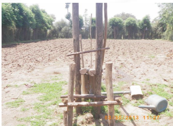
Figure 7. Mr. Girma's manually drilled well with suction-only treadle pump.

Mr. Girma irrigates 1325 m 2 from his two wells and grows kale and green pepper (Table 2).