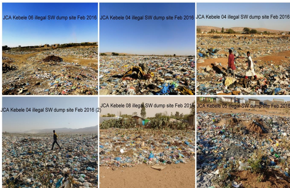
Photos 7-12: Different locations of unauthorised dumping across the city

On both official and illegal dumpsite, informal waste pickers are searching for important recyclable materials (metals) and scattered waste attracts dogs and rodents.