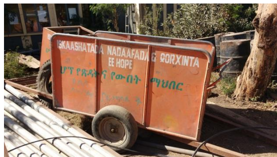
Photo 3: Solid waste collection push cart provided for Hope by the city S&B Agency

The safe disposal of the collected solid waste is also a challenge that the S&B Agency and the Associations face.