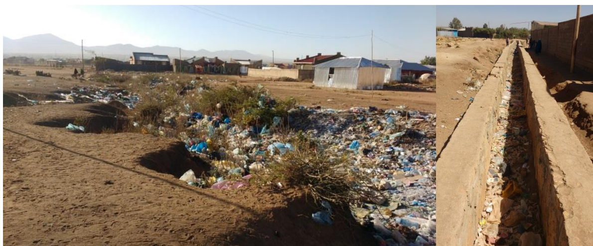
Photos 5-6: Unauthorised dumping on open ground and in drains in Kebele 7.