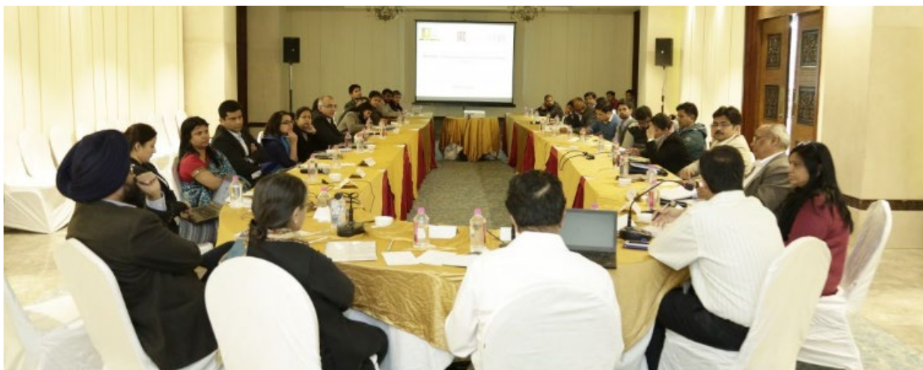
Participants at “Insights”: WASH Dialogue & Partnership Forum on “FSSM Matters: The Way Forward”, 10th January 2017 in Jaipur, India. Photo: India Sanitation Coalition