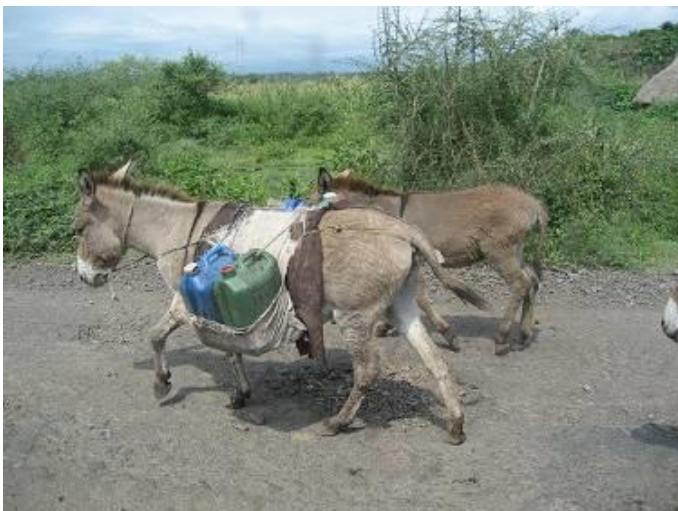
Figure 2 Donkeys carrying several jerry cans of water

Long waiting lines at water points are an important burden for people and particularly women and children. This is aggravated by the fact that no sanitary facilities are available in the area of the water points. This burden however can be turned into an opportunity by establishing a public toilet in the area. If separate urinals are installed the toilet can become an important source for urine that can be used as fertilizer. Local farmers may be willing to pay for this fertilizer and these resources can be used to manage the toilet.