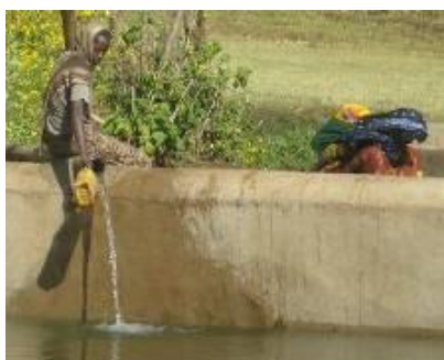
Figure 1 Woman collecting water from the irrigation reservoir in Ifa Daba

In Ifa Daba, in the same woreda, HSC capped a spring and diverted the water into an irrigation reservoir, from which lined irrigation canals divert water to irrigated plots. However, people collected water from the irrigation reservoir for domestic water as well. Collecting this water was not easy and quite time consuming (see picture). Therefore, HSC decided to add a water tap from which people could collect water for domestic use.