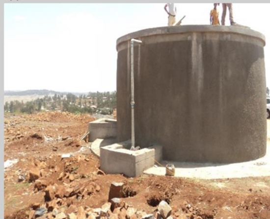
Proper civil work execution using the BCBT

and a willingness to experiment. BCBT as a new contracting arrangement can only bring improved efficiency and effectiveness if key stakeholders are willing to change the way contracts are administered with less bureaucracy and flexibility from the client side and enhanced project management arrangement from the contractor side.