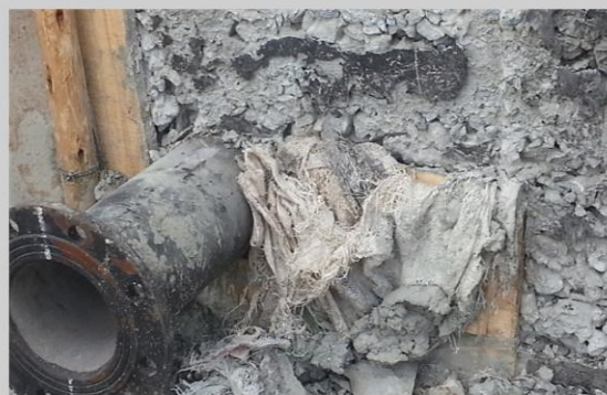
Poor quality casting from an individual contracting approach