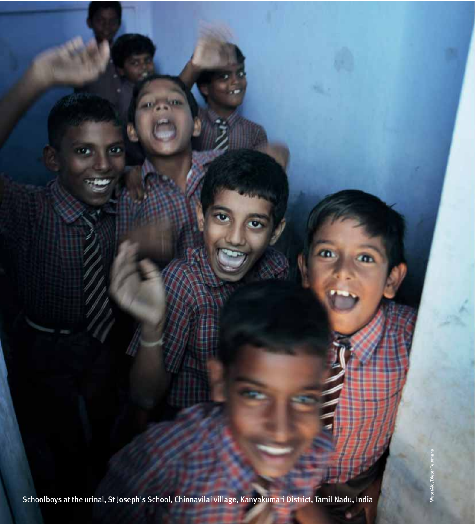
Schoolboys at the urinal, St Joseph's School, Chinnavilai village, Kanyakumari District, Tamil Nadu, India