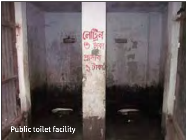
Public toilet facility