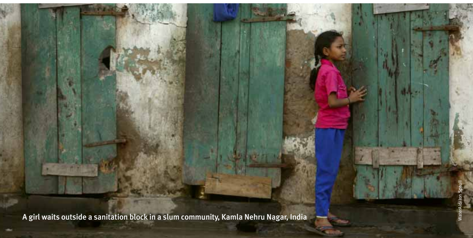
A girl waits outside a sanitation block in a slum community, Kamla Nehru Nagar, India

In Nepal, almost all schools have separate toilets for boys and girls; however, some schools have not paid sufficient attention to the needs of small children while constructing the toilets. Secondary and higher secondary schools have better toilets than primary schools. Not all toilets are maintained properly and some suffer from an acute shortage of water. In fact, some school toilets have fallen into neglect and disuse.