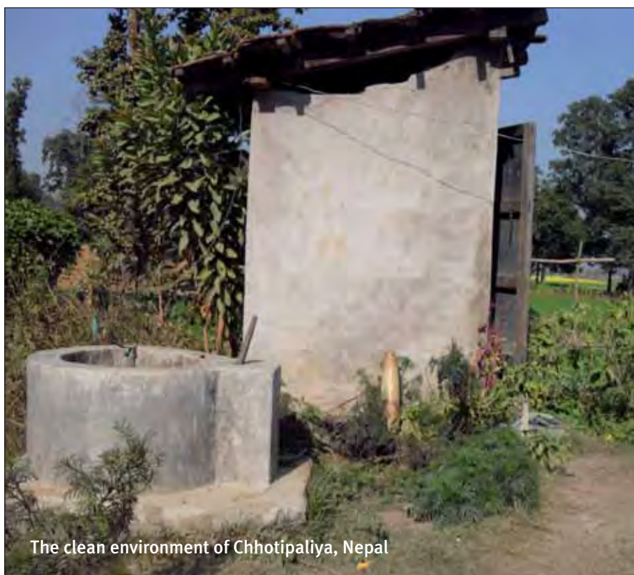
The clean environment of Chhotipaliya, Nepal

form a user committee and its members were trained in health and sanitation. The user committee built a reliable and safe drinking water supply system with external help and also ran a health and sanitation education programme which made each community member sensitive to health and hygiene issues. All the households constructed their own temporary or permanent toilets near their houses.