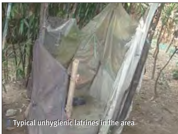
Typical unhygienic latrines in the area

Firuza believes sanitation facilities should be made available for the poor, with a subsidy provided if necessary – people should be made aware of the benefits of sanitation and hygiene, and water for sanitation should be made available. She