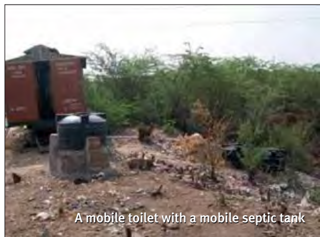
A mobile toilet with a mobile septic tank