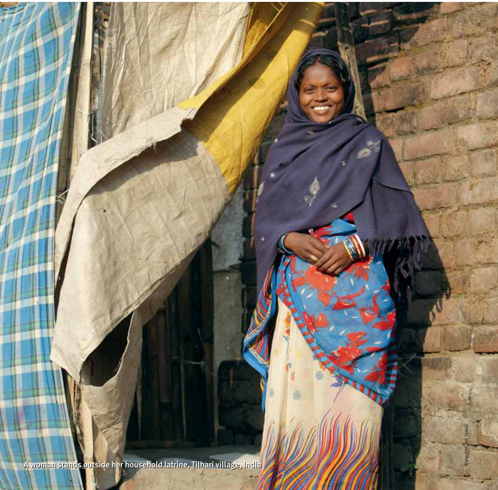
A woman stands outside her household latrine, Tilhari village, India

In Bangladesh, after interventions were phased out it was found that many of the hygienic toilets constructed were no longer hygienic because of broken slabs and seats, broken water seals, and filled up pits due to the poor quality of construction. In addition, the design and technology itself was perceived to be inappropriate for specific locations. People pointed out that the geophysical characteristics of the coastal inland saline areas, coastal islands, the hill and Haor districts were all different, calling for different sanitation technologies. In India, maintenance was perceived to be the primary reason for the failure of many projects, especially for community facilities like toilets. Communities also refused to use incomplete or damaged toilets. In Sri Lanka too, technical quality and inappropriate designs have plagued the sector. Projects in the Tsunami affected areas are the most glaring examples of poor quality work.