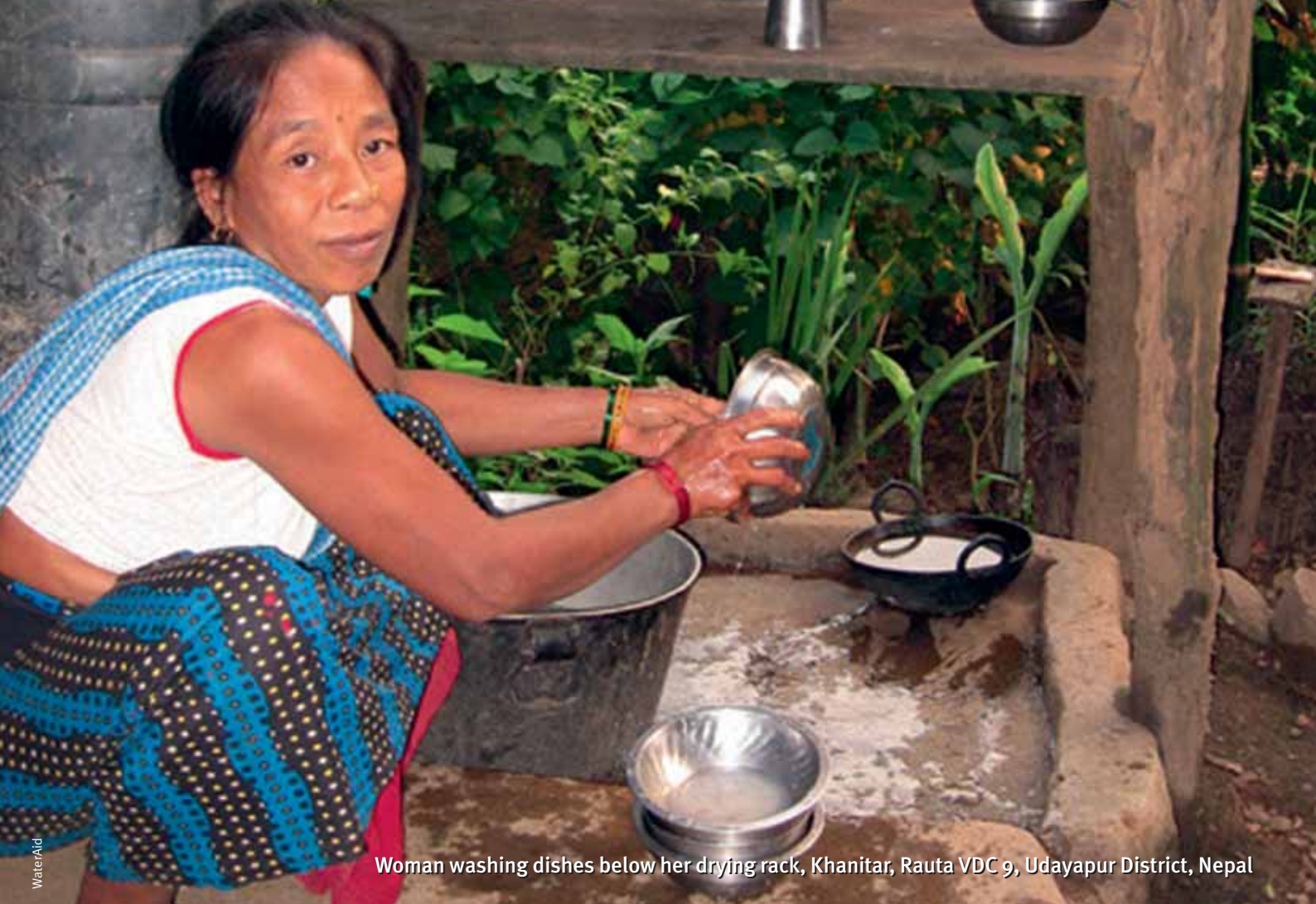
Woman washing dishes below her drying rack, Khanitar, Rauta VDC 9, Udayapur District, Nepal

The level of understanding of sanitation and hygiene, and its articulation, was influenced to an extent by both the educational attainment of respondents and interventions in the area. Interventions made communities more educated and aware, and in turn people in these communities described sanitation as ‘hygienic toilets’, ‘closed drainage’ and ‘rubbish-free settlements’. For such communities, it also meant regular maintenance of the facilities and sustained availability of services.