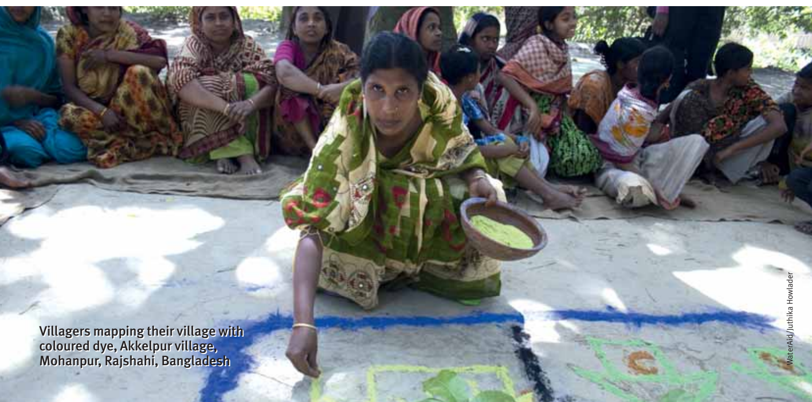
Villagers mapping their village with coloured dye, Akkelpur village, Mohanpur, Rajshahi, Bangladesh

By and large, communities now understand that using hygienic latrines, safe drinking water and improved hygiene practices are important components of sanitation that keep them healthy and free from disease burdens. Keeping the surrounding environment clean, disposing of solid waste safely, and disposing of household and kitchen wastewater safely through a drainage system are also seen as integral parts of sanitation.