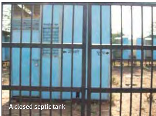
A closed septic tank

The community feels that the shortage of drinking water is a primary reason for the lack of sanitation efforts of the government and community. Because they do not even have enough water to drink, the community resists the idea of using that water for toilet facilities. In addition, the nearby forest is not very dense and is accessible to all, providing an easy alternative for dumping rubbish and defecation. The local leaders also have vested reasons for not taking up the matter with government authorities.