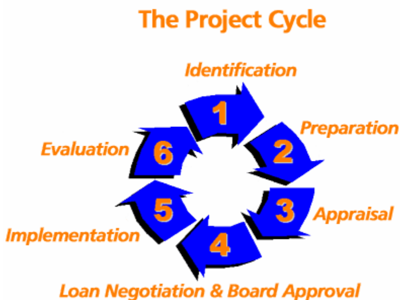
Figure 4.1 The ADB Project Cycle

The ADB development assistance adopts a Project Cycle which follows 6 stages, similar to that of the World Bank. Below is a step-by-step guide to the project cycle and details on information that is available at various points in the project cycle (Table 4.1).