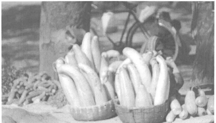
Women waiting for buyers in a weekly local market

These rural women, who are generally confined to their households in patriarchal communities, now have an opportunity to come out in the marketplace and transact business. The field observation shows that while patriarchal sentiments may tend to regulate the use of technologies, technology use in turn might lead to a shift in gender power relation, particularly if the technology is not gender biased. For example, in any of these rural households, it was men who participated in promotional activities of intervening agencies and took a unilateral decision of installing the technology. Once the technology got