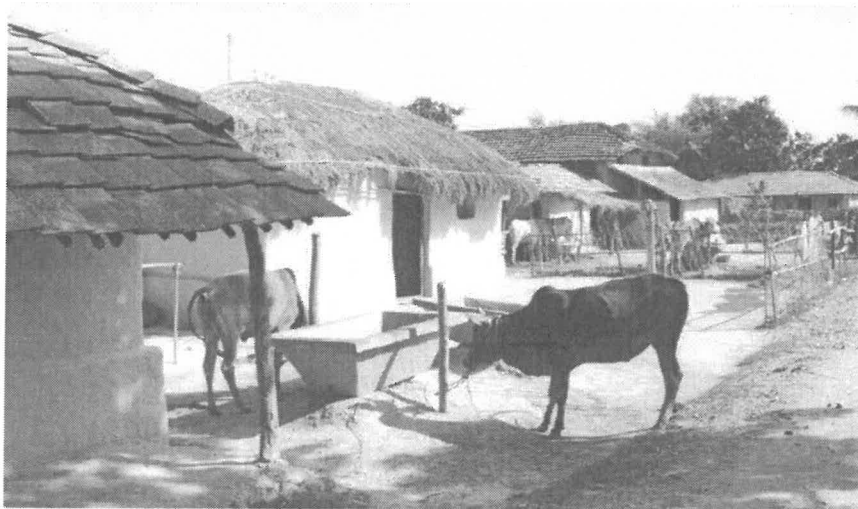
The study village, Nepal

Treadle pumps in Nepal terai have somewhat transformed rural communities. We observed that even smallholder households were into commercial vegetable cultivation. It has boosted production, thereby reducing the reliance on imported vegetables from India. It was revealed in the FGDs that