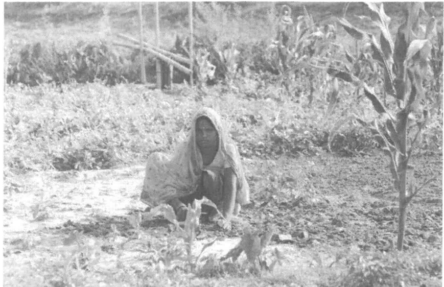
A FORWARD programme participant is busy weeding

Several international non-government organisations (INGOs), non-government organisations (NGOs) and voluntary organisations are promoting TPs in the Nepal terai . For example, IDE has been in Siraha and Saptari districts, in central Nepal, where it promotes TP along with creating a supply chain network of manufacturers, dealers, and installers. Further east, innovative TP-based programmes are run by Forum for Rural Welfare and Agricultural Reform for Development (FORWARD) and Local Initiative for Biodiversity Research and Development (Li-BIRD), in collaboration with PLAN International, in Morang and Sunsari districts. They organise landless people in groups. One group consisting of 14-18 landless households have been motivated to cultivate vegetables commercially. Then, a huge chunk of land is leased for five years and each household is allocated two kathas (0.0676 ha) of land for their share of cultivation. In the first year, all input costs are shouldered by the programme, and this support goes down by 25 per cent every succeeding year. Land rental is treated in the same way. Given the higher rate of return, the programme should be sustainable so that in five years the