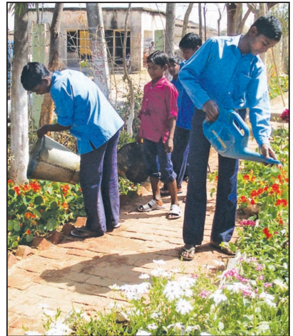
The Ministry of Gardening maintains the garden

This school is one of 2,830 schools in Jharkhand to be reached by Swasthh, and every school is different – in size, facilities, student make-up, and local familiarity with toilets and hygiene. Experience shows that repeated rounds of training and familiarization with new concepts work. Because Kakaria is remote, some aspects are not as strong as they might be. There is as yet no toilet for boys; even Parvati cannot recite with confidence the causes of diarrhoea; and a solid