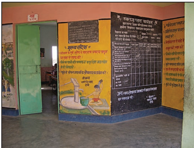
The Swasthh Décor at the Reshan School

Now people dig pits and bury it. Children tell their mothers to wash their hands before cooking and eating, and their mothers do what they say. In two years, we have really seen a difference. Diseases have dropped considerably and the village is clean.’