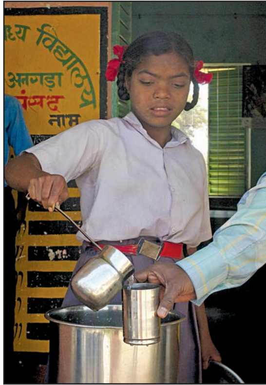
The Reshan Minister of Water