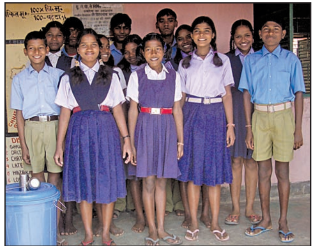
Parvati and the Child Cabinet in Kakaria

separate block for girls. Attendance is poor, classes large, much learning is by rote, and teachers and students often lack motivation. Parents may see little point in insisting their children attend, rather than do useful work at home. All these factors