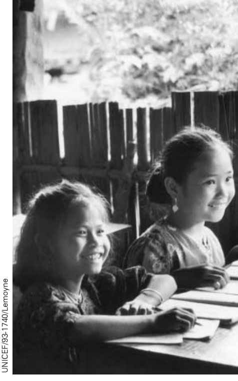
In many countries, girls are more likely to attend school when sanitation facilities protect their modesty or when separate facilities are provided for girls and boys. Here, Chinese girls enjoy class at their local school.

Girls also commonly miss out on an education if school sanitation facilities are inadequate. And if schools lack separate facilities for girls and boys, many girls do not attend, especially during their menstruation. In Bangladesh, a UNICEF-supported school sanitation project that promotes separate facilities has helped boost girls' school attendance 11 per cent per year, on average, since the project started in 1992.