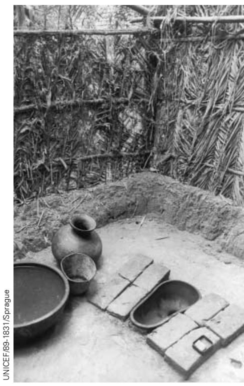
Good latrines can be simple, like this one made from local materials in rural Banéladesh.