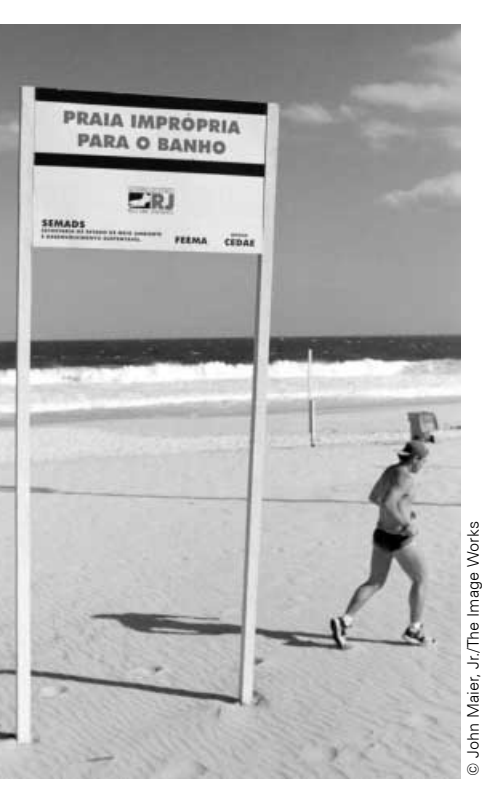
This popular beach in Rio de Janeiro (Brazil) was closed in 1999 because of the city's sewage problems, which also affected commercial fishing.