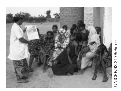
Hygiene instruction is an important activity at this community health centre in Mali.

In ZAMBIA, with central government support, villages in 10 of the country's most deprived districts work with local governments to plan, maintain and manage their own water and sanitation facilities. Since the programme began in 1995 several villages have provided sanitation to all residents.