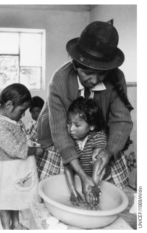
Hygiene begins with washing hands, as these Bolivian children are learning.