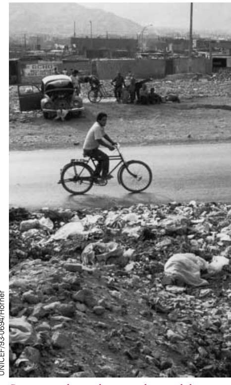
Poor waste disposal is not only unsightly but unsafe in this neighbourhood on the outskirts of Lima.

Unless immediate action is taken, the number of people without adequate sanitation will climb to more than 4.5 billion in just 20 years. Hardest hit will be the marginalized poor living in densely populated cities that even today manage to provide only two thirds of their population with sanitation services.