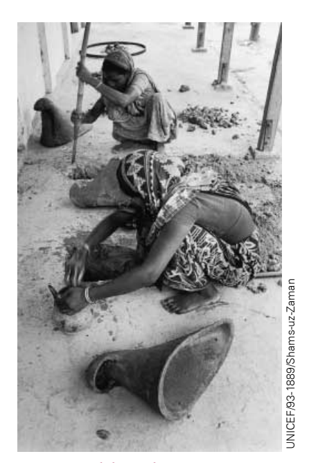
Projects work best when community members plan and manage them. Here, Bangladeshi women produce latrine components in their community as part of a government sanitation programme.

In INDIA, communities help operate 'zero subsidy' sanitation: In Medinipur district of West Bengal, 82 villages have latrines in every household and 100,000 latrines are constructed yearly, thanks to a project that has cut latrine costs and involved entire communities. The latrines are manufactured largely by local masons — many of them women — and are paid for by community members. Youth and women's groups play a major role in planning and implementation of the programme, which promotes latrine use and good hygiene through exhibitions, promotional materials, home visits and motivational seminars.