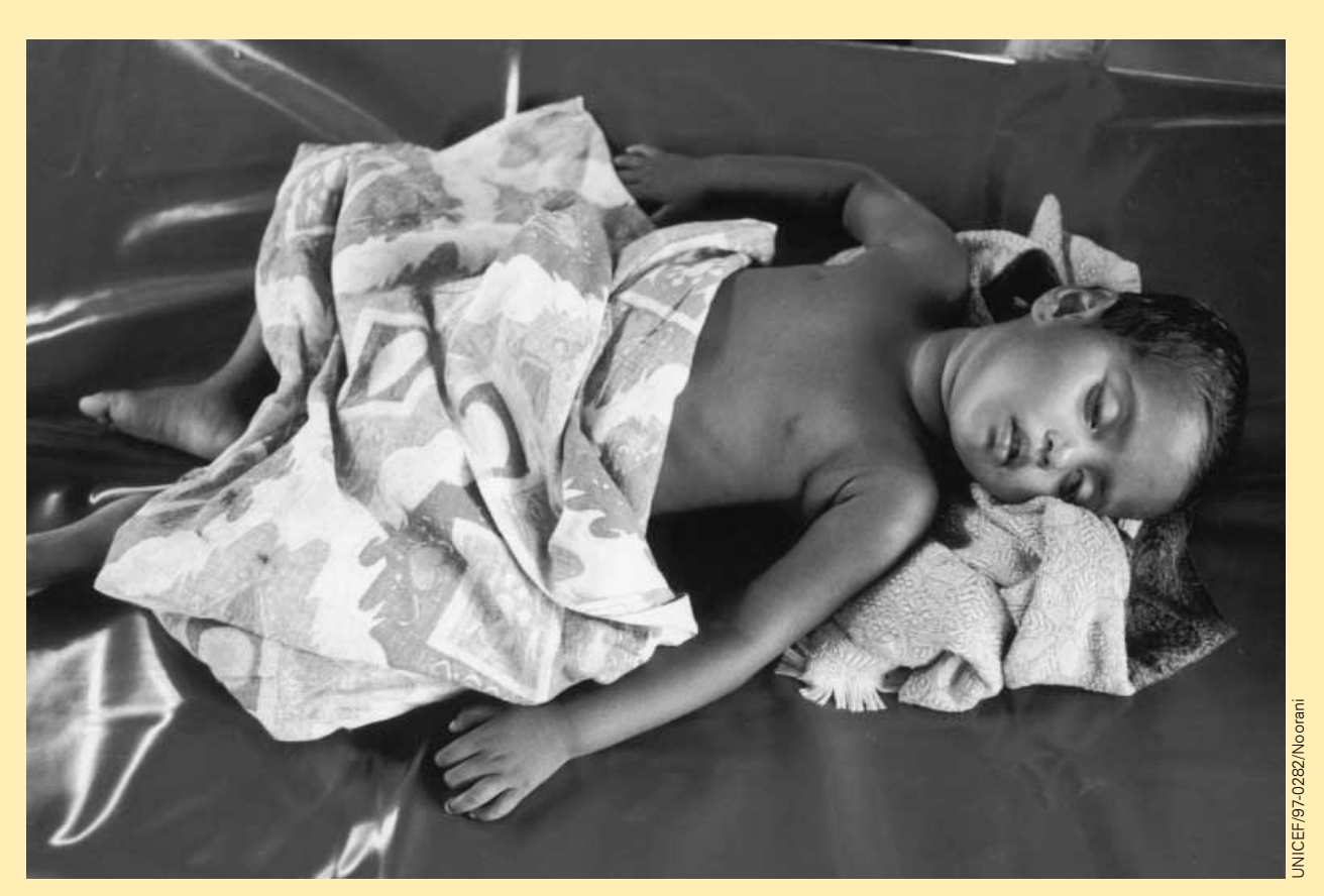
\label{lem:approx} A\ Pakistani\ boy\ lies\ semi-conscious\ from\ diarrhoeal\ dehydration.