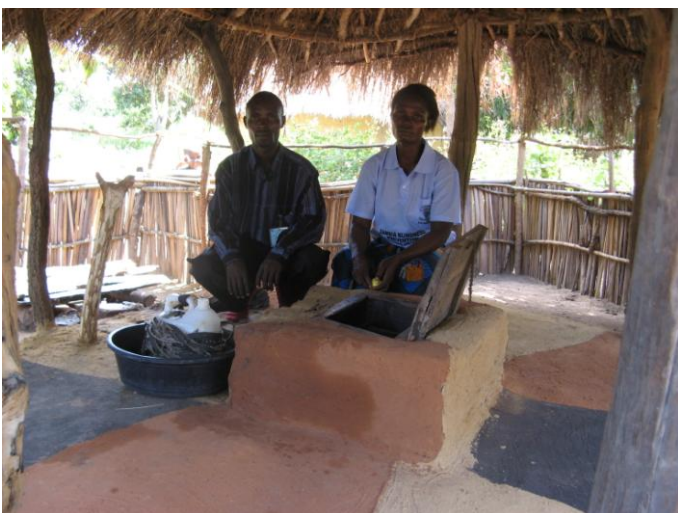
Figure 2 Family well in Mali

Ethiopia has initially concentrated on the relevance of the approach to its Universal Access Plan (UAP) and how to incorporate low cost options and household investment into government strategy. The other three countries have all been piloting the approach to see what it means on the ground and whether the results justify incorporating it into their strategies for health (risk reduction) or water (access and reliability of quality and quantity). Table 2 sets out the current roles of the various players.