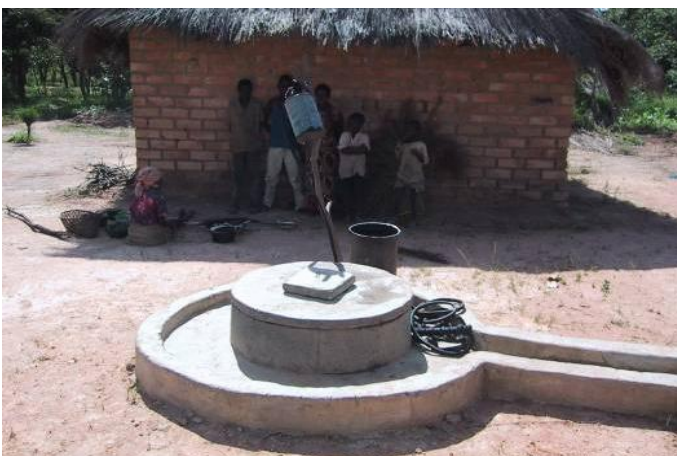
Figure 4 Improved well protection in Zambia