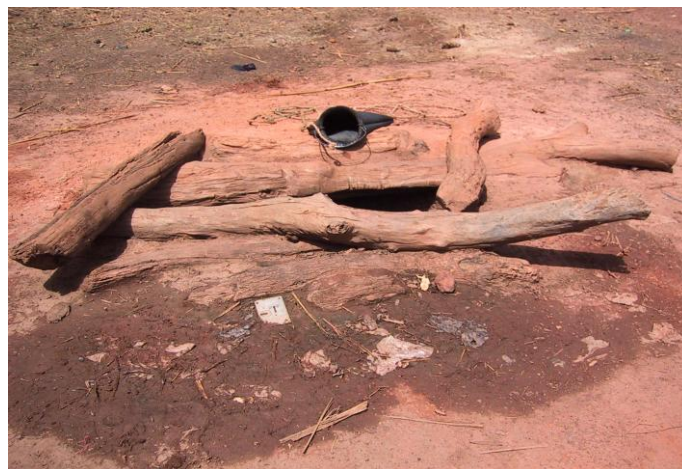
Figure 3 Mali traditional well with minimal protection

Others have copied individual features of well-protection in their own ways, showing that the piloting has not only established a long-term capacity for good quality supply improvements, but also created a growing demand and understanding of the principles.