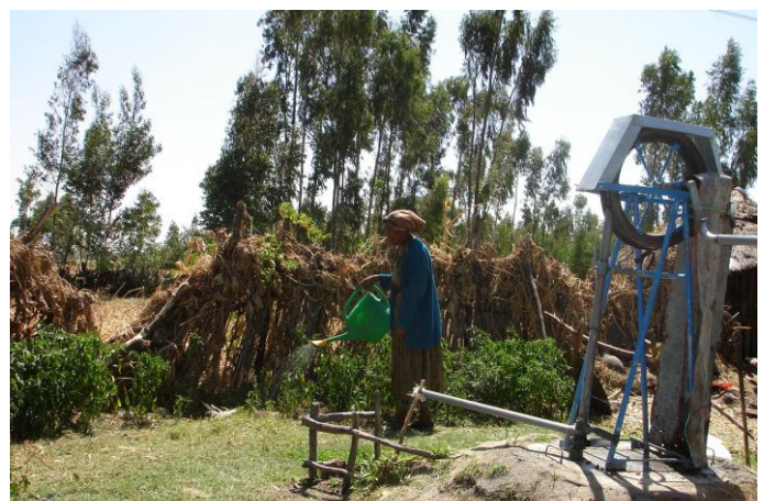
Figure 6 Early Self Supply demonstration in Ethiopia

In addition, benchmarking studies in two regions (Oromia and SNNPR) are being undertaken by UNICEF and RiPPLE. The RiPPLE study looks at socio-economic as well as performance aspects of Self Supply systems. Both studies will help to define the levels of protection necessary to be regarded as an acceptable level of supply for households or for communities, based on the performance of systems already in place. The same is needed in other piloting countries.