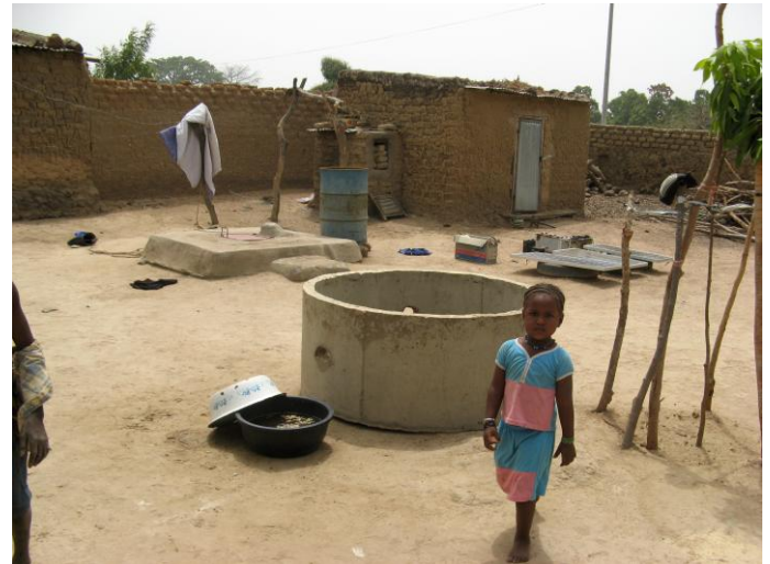
Figure 13 Charging Batteries brings in additional income to invest in family well improvements.

To learn fully from what has been achieved requires systematic monitoring of the performance, impact and user satisfaction of supply improvements. A historical reality of the water supply source improvements is that funds are much more easily accessed for constructing something or even repeatedly rehabilitating it than for monitoring. Finding funds to analyse what is going wrong or to put in place support mechanisms which would reduce the need for new construction or rehabilitation is much more difficult as the outputs cannot immediately be counted. In the case of piloting, recording what is done is essential for lessons to be learnt and best practices to be adopted. There is need to collect information on performance, costs, user satisfaction, equity, water quality, the spread of ideas through copying what others are seen to have done and private sector growth. UNICEF Zambia has a documentation strategy in place and Self Supply in Uganda has been the focus of many MSc theses. As the systematic monitoring of these aspects is still lacking, it is not yet possible to fully understand the outcomes and impact of the self Supply piloting