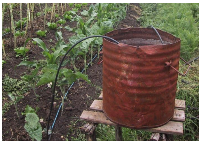
Figure 9 Combining Family wells with low cost irrigation

Costs vary largely from country to country and region to region. Costs depend on the availability of skilled labour, materials, and the depth to water or size of storage required. The Uganda piloting suggests that with a community contribution of 40% and lower design specification, the cost of an improved groundwater source to the State is reduced by 85%. In Mali costs of up-grading were brought down to 75-90% of conventional source improvements, and can be reduced even further. By taking the incremental household investment approach, piloting shows that unit costs can be brought down to levels which people can afford and are willing to pay. Per capita costs may still be high because there may be fewer users per unit. However, unlike the case of conventional community supplies, the unit is affordable to users. Self Supply should not be evaluated by the same economic yardsticks as communal supplies. It is comparable to saying a bicycle cost more per head than a bus without considering aspects such as sustainability, management, affordability and flexibility of use.