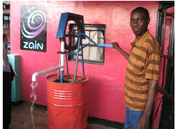
Figure 11 Marketing the Rope Pump In Zambia

One constraint to the adoption of higher levels of technology in well-up-grading is that the culture of not paying for access to water means that the costs fall all on one family who traditionally cannot ask others to pay towards their costs.