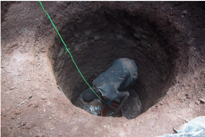
Figure 7 Simple Well Construction, Oromia, Ethiopia

A different set of conditions may exist where government wants Self Supply to provide improved water supplies because low population density and/or remoteness make conventional community supplies difficult to establish sustainably. In this case individuals will be fulfilling the role that government has taken elsewhere, in being providers of water in a formal capacity. If these supplies are to be included in planning and coverage statistics, there may be a need to use incentives for home-owners to take the responsibility to reach government targets in a given time.