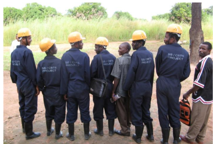
Figure 8 Rural Artisans Trained by WaterAid to make a living protecting family wells in Luapula, Zambia

An NGO could form the advice centre but it would be more sustainable if it were a capacity built up in the private sector or in a health or water department as these are less dependent on outside funding. It is very important to consider the long-term reliability of support from the outset.