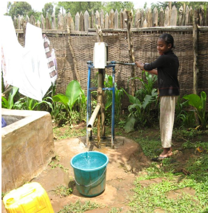
Figure 14 A family well for drinking water, laundry, gardening and many other uses

It is important to see Self Supply acceleration not as achieving specific targets for access to a safe water supply, but rather as the strengthening of support services. In other words, local organisations and institutions are given the capacity to advise individuals and communities in: