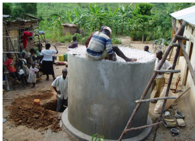
Figure 12 In Uganda, group saving schemes have enabled rainwater harvesting facilities to be constructed