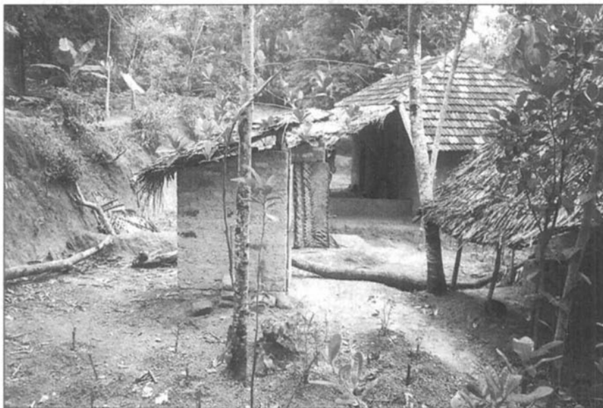
Although building physical structures is important, a sanitation programme is primarily about behaviour.

guidelines developed over the years. The names of the chosen families are posted in public areas to allow for complaints. Ten per cent of the families selected, and all complaints, are checked personally by SEU project staff.