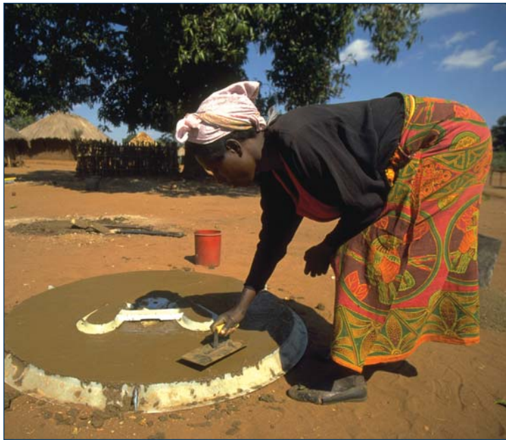
Making a cement slab for a latrine, Zambia