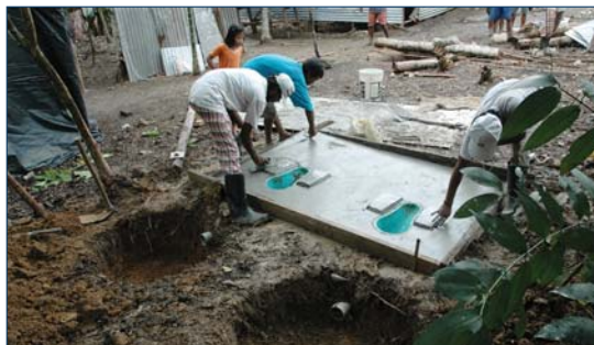
Buildign leach pit latrines, India

Methods, approaches, data requirements and minimum knowledge requirements have to be defined for both water and health professionals. Train-the-trainer programmes can be used effectively to enhance local capacity, strengthen retention and provide peer-to-peer training that is sensitive to social and cultural frameworks. Incentives