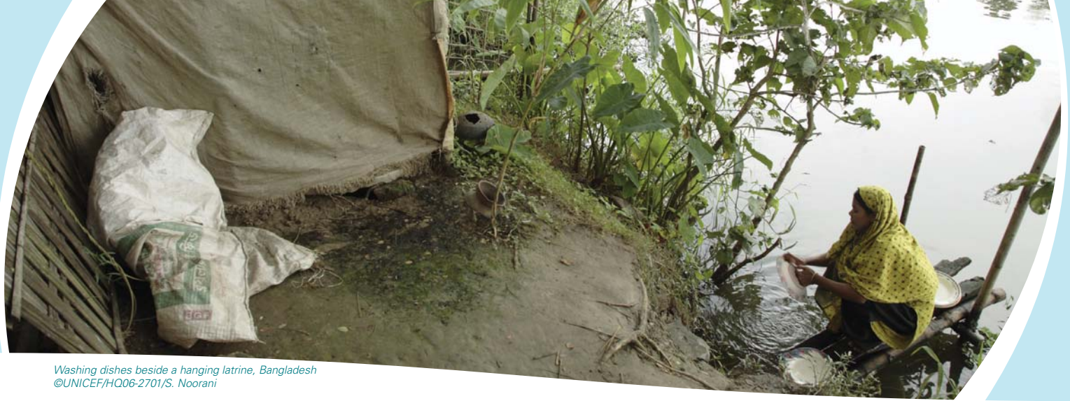
Washing dishes beside a hanging latrine, Bangladesh