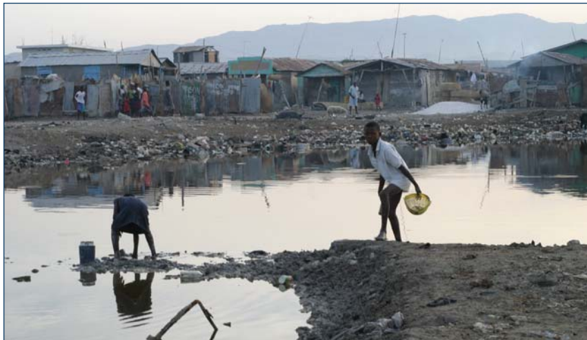
Shrimp fishing in sewage-infested flood waters, Haiti

that there is more time to tend to crops and livestock, more time and resources to spend on improved food preparation, more time to attend school and, an opportunity to participate in the local economy; all mechanisms which work towards breaking the cycle of poverty.