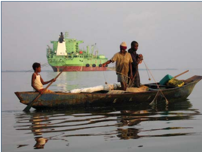
Fishing in oil polluted water, Nigeria

It is becoming increasingly apparent that large volumes of water are unaccounted for within water management structures around the world. Termed virtual water, this water is the amount used to produce items from food items to vehicles. According to the World Water Council, 1000 l of water is required to produce 1 kg of wheat. A single kilogram of beef requires 16 000 l (Waterfootprint.org). By understanding this trade in virtual water, it is possible to manage imports within an IWRM framework in order to maximise water availability for domestic purposes. Thus, if a country has water scarcity issues, it should not be trying to develop a beef export market or any other product with a large virtual water footprint. Rather, it should be exporting products with a small virtual water footprint and importing those which use significant volumes of water to produce. This will become increasingly important with the push towards biofuel production. In addition to the issues associated with food versus fuel production, there is an equally important discussion surrounding the amount of water required to produce these crops and how this affects the water budget of the region.