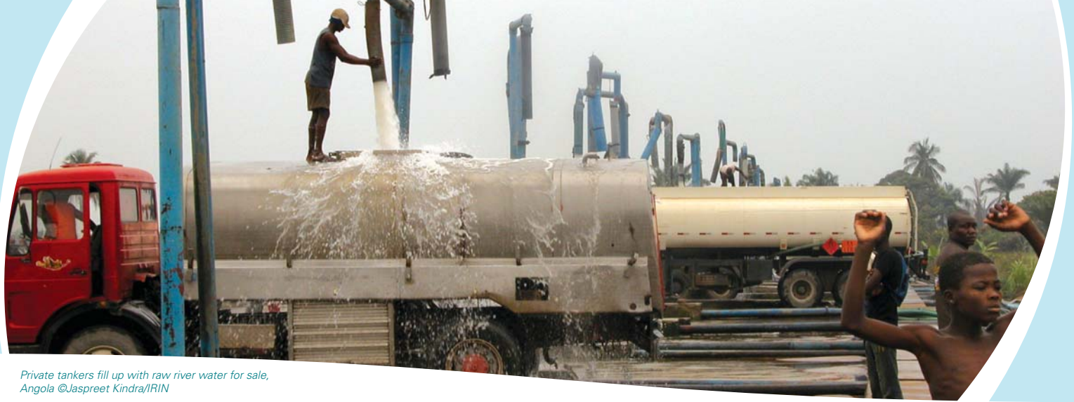
Private tankers fill up with raw river water for sale, Angola

such as opportunities for promotion, greater responsibilities or enhanced standing in the community can all be effective, not only for participation, but for retention of capacity once established. Additional capacity building and retention practices include diplomas, certification courses and curriculum credits for continuing education, which further serve to enhance dissemination of current and emerging knowledge, especially to the front-line.