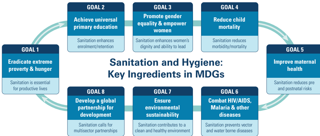
Figure 1: Sanitation and Hygiene: Key Ingredients in MDGs (modified from Mehta and Knapp, 2004)

that the transition from unimproved to improved sanitation is accompanied by more than a 30% reduction in child mortality (e.g. Esrey et al., 2001).