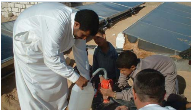
Solar desalination, Egypt: Courtesy of T. Schaff, UNESCO

Schools are cornerstones for education within the community. By emphasizing the importance of responsibility for their own health and links between residential actions and environmental effects to children, the uptake of new practices is disseminated into both the household and the community as a whole. In general, educating individuals can have the additional advantage of reducing the number of stressors that they face, resulting in improved health. Moreover, there are benefits accrued from the more rapid uptake, and enhanced health benefits, of water and sanitation solutions that are associated with increased education and awareness. There is a need to create local centres with a knowledge-based and innovative approach to training that ensures availability to and appropriateness for operators in small, remote communities and which address both long and short-term needs. In addition to training, opportunities exist to provide technology demonstrations, operation and maintenance support, education and outreach, advice for governments on research and development priorities, scholarships to Universities and partnerships with research groups.