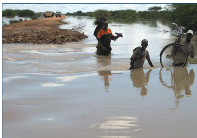
Wading through flood waters, Kenya

People can circumnavigate the globe in less than 24 hours, carrying diseases with them and exposing others even before manifestation of symptoms. Surveillance of disease has become international in scope, as evidenced by the