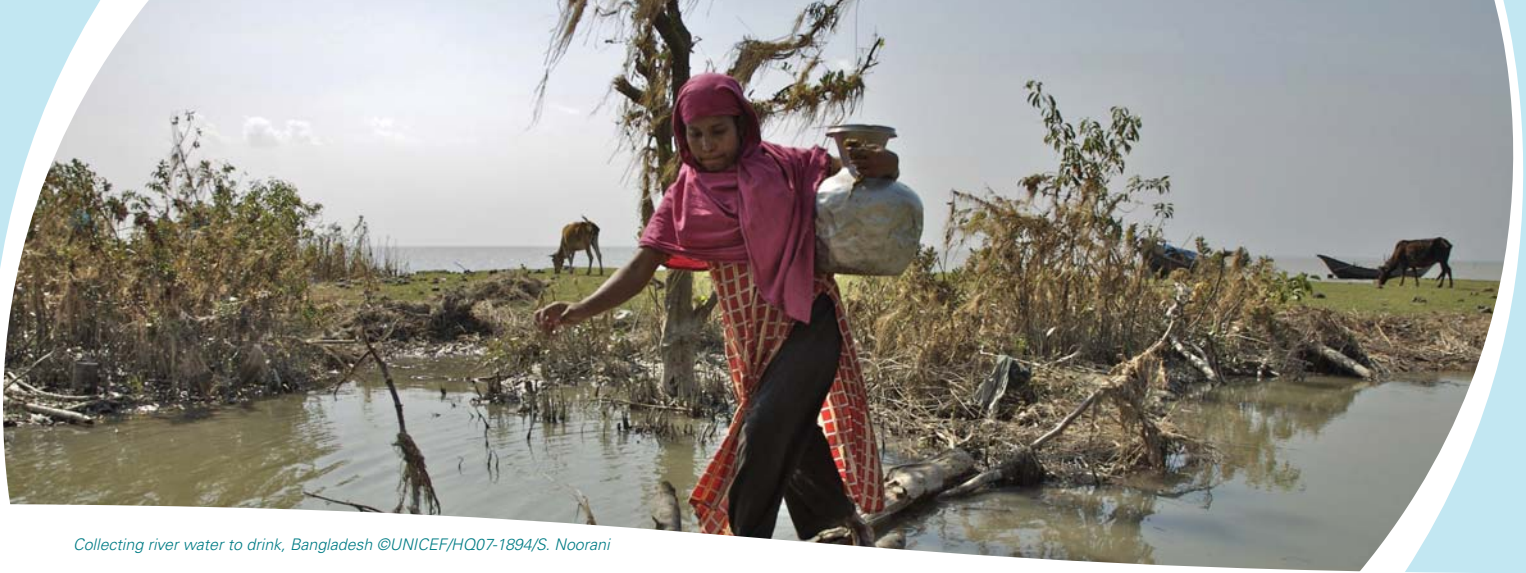
Collecting river water to drink, Bangladesh