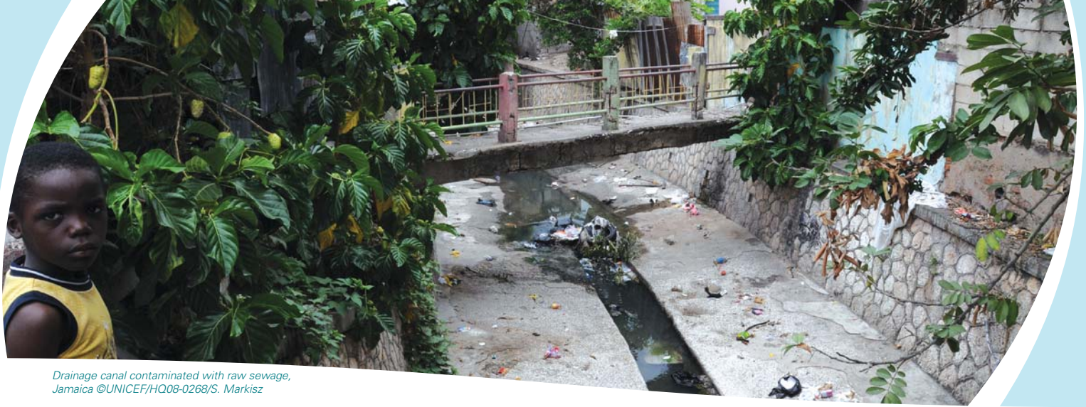
Drainage canal contaminated with raw sewage, Jamaica

Humanity has always depended on the services provided by the biosphere and its ecosystems. Water management without regard for the ecosystem unit is set up for failure from the outset, as all aspects of ecosystem health have to be addressed to maintain equilibrium within the system. Given the significant and ever-increasing demand for services, ecosystems are being changed to alter the provisioning ratios (e.g. converting forest to agricultural land). In many cases, this contributes to degradation of ecosystems, further reducing the capacity to provide the services that we depend upon. The resulting burden is disproportionately held by rural communities, especially those who are impoverished. Further, environmental/water conservation and good use by local people will depend on their objective living conditions and the capacity to meet their basic immediate material needs (e.g. if a family cannot afford to purchase fuel, they will harvest local materials for their needs). As identified by Corvalan et al. (2005), allowing the continuation of ecosystem degradation is preventing achievement of the MDGs.