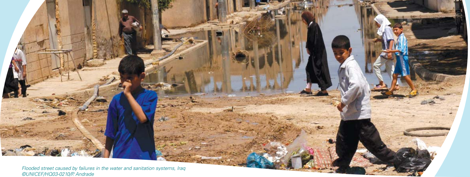
Flooded street caused by failures in the water and sanitation systems, Iraq