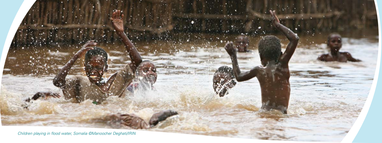
Children playing in flood water, Somalia

Key requirements to improving human health and well-being within the context of safe water include: