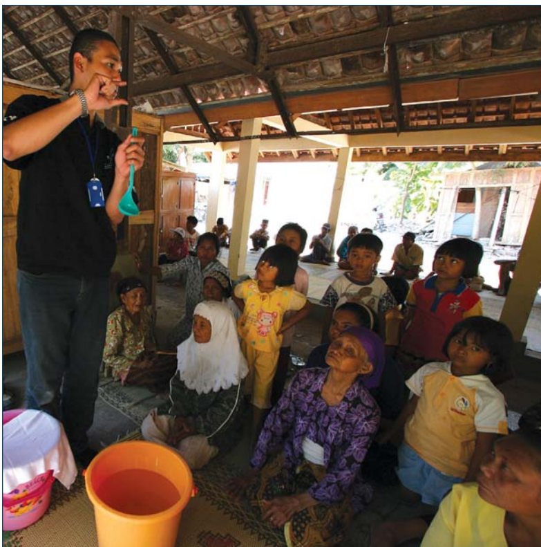
Demonstrating water treatment supplies, Indonesia

A better understanding of the functions and connections of natural and social systems has to be achieved. In order to optimize investments and the resultant benefits, a strategy is required which takes the natural distribution of water and the potential implications of climate change into account. Generally, a broader approach is required to include water-health perspectives into plans and activities to address the significant challenge of meeting the MDGs and improving the quality of life of people around the globe. Actions required to meet these goals include provision of water supply, sanitation and treatment infrastructure as well as promotion and education of proper hygiene and integrated water resource management. Policy and legal frameworks that fit within this context need to be developed at the national and international level.