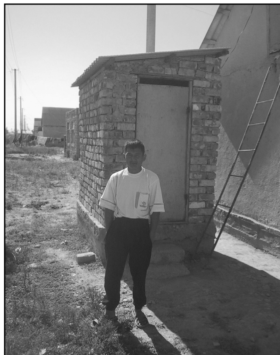
This Ventilated Improved Pit Latrine (VIP) in Kyrgyzstan was constructed by the house owner, based on his observations of latrines seen in rural areas.

participation in planning and programming will generally result in interventions that are more cost effective and whose benefits are more equitably distributed.