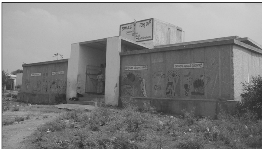
A community-based sanitation complex in Bangalore, India, implemented by the NGO Grama Swaraj Samithi (GSS) with support from FEDINA/BORDA, serves a community which relocated from an inner-city slum to the outskirts of the city. The wastewater from the latrines and washing facilities is treated on-site with an anaerobic digester, which produces biogas, followed by tertiary treatment using a reedbed.

wastewater management for the poor living in more densely populated urban informal areas are increasingly part of World Bank projects. In urban areas, the World Bank is becoming more active in basic sanitation by supporting both on-site sanitation (with septic systems) and low-cost simplified sewerage in countries like Brazil, Ecuador, Peru, India, Senegal and Burkina Faso. Projects support: policies that encourage and promote sanitation and hygiene, capable institutions with clearly defined roles and responsibilities, clear and effective financing mechanisms and subsidy policies, and local community structures that take the responsibility for operating and maintaining local systems.