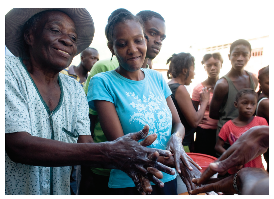
The Eawag research suggests that combining practical demonstrations of hand washing with distribution of hygiene materials has been an effective hygiene-promotion activity in Haiti.

For people affected by disaster, whether wars, earthquakes, or disease epidemics, conditions of life can change suddenly and in ways that require rapid adjustments. Often, adaptation includes taking greater care to prevent transmission of disease, in order to minimize the new threats to public health. Understanding what enables and influences changes in human behavior is key to developing and evaluating strong hygiene programs, so Eawag placed the issue—and the science—of behavior change front and center in its study.