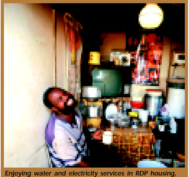
Enjoying water and electricity services in RDP housing, Orange Farm, Gauteng.