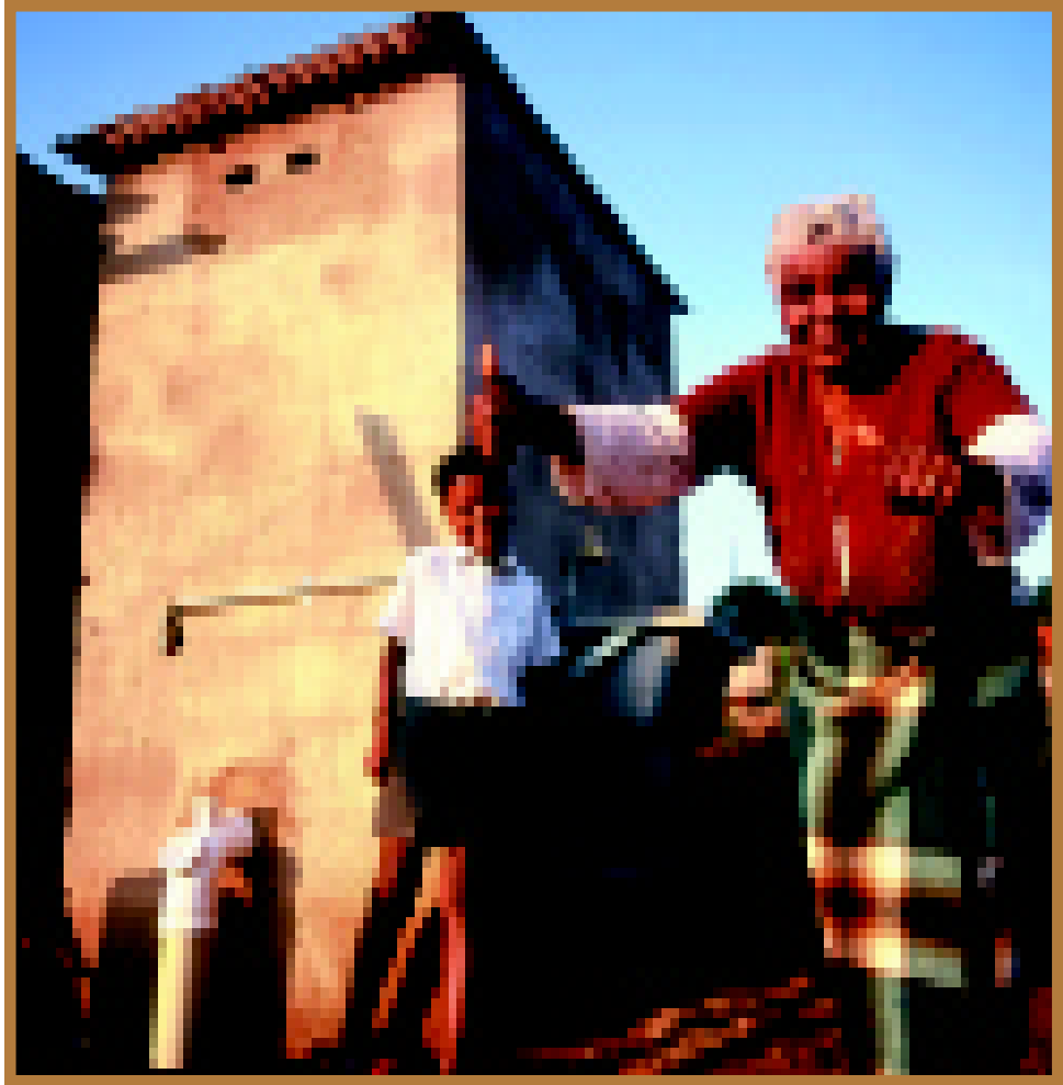
A woman signals approval of her flush toilet, Kwazulu-Natal urban development, Pietermaritzburg.

· On the other hand, the direct participation of the private sector in service provision has been tried but is not a major factor in service delivery. Only a few small and medium-sized towns have established long-term concession arrangements. As has already been described, the use of BoTT contracts to involve the private sector in DWAF's rural water service provision had only limited success. Given the current economic and political