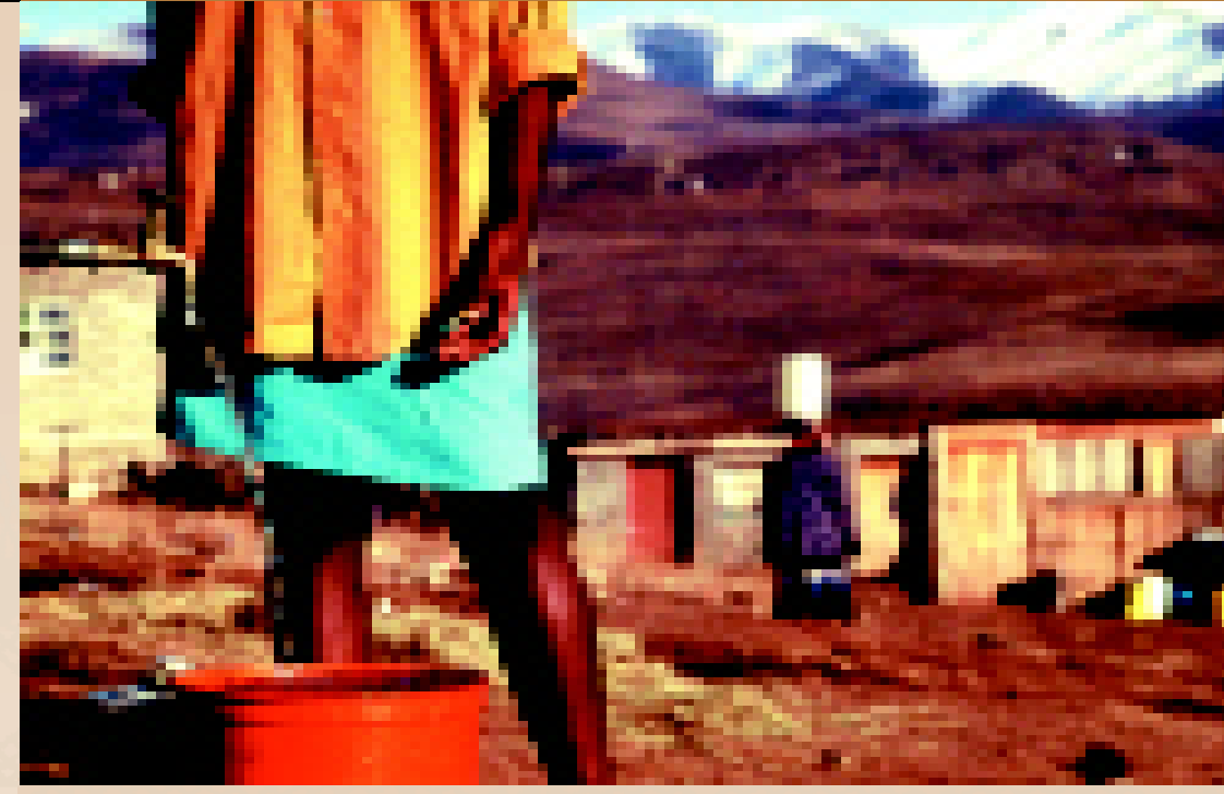
This stand-pipe in Bokong, Maluti Mountains, saves women a six-mile walk.