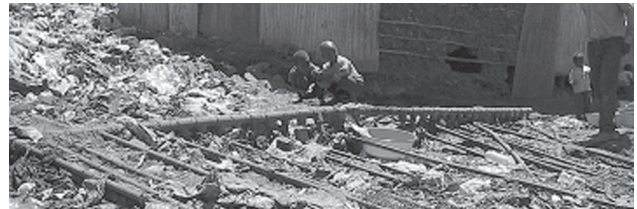
Figure 1: Children collect precious water in the red tub from leaking pipes.

A significant constraint in poverty reduction of the people of Kibera is the state of the living environment. This is largely a product of a legal gap, unclear policy framework and lack of effective action to improve living conditions. Inadequate water supply and sanitation are among the most serious environmental concerns posed to the people of Kibera. Most people in Kibera get water from private water kiosks operators who lay long plastic pipes (at times as much as 1,500 meters) from the city utility's main network and transport the water to store in tanks (with 2 to 6 m 3 capacity). Then the water is retailed to the consumers.