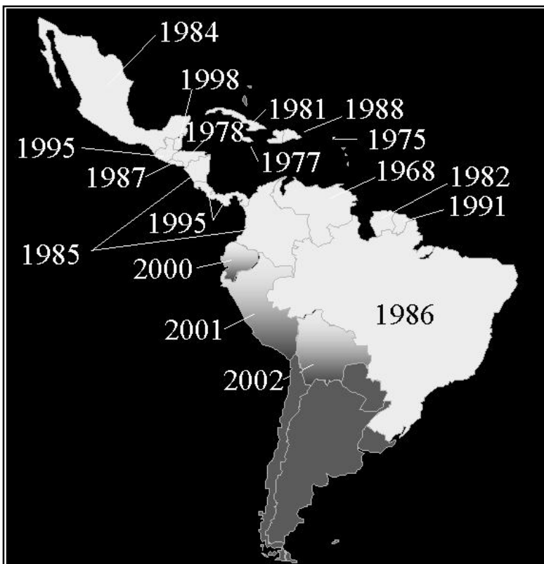
Figure 2: The Evolution of DHF