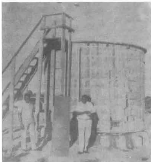
Photograph No. 4 Woodstave tank on ground

Construction of wooden Pipes and Tanks is done in the field after delivery of required timber staves and steel bands at the site laying of a wooden pipeline is done by joining timber staves side by side at cross sectional direction while on longitudinal direction timber staves are joined in a stagared manner. For smaller diameter pipes eg. 6.3 cm downward a polythylene socket joint is provided. Wooden Tanks on ground or on wooden raiser are constructed similar to wooden pipes but on vertical direction. (See Photograph No. 5 and No. 6 below).