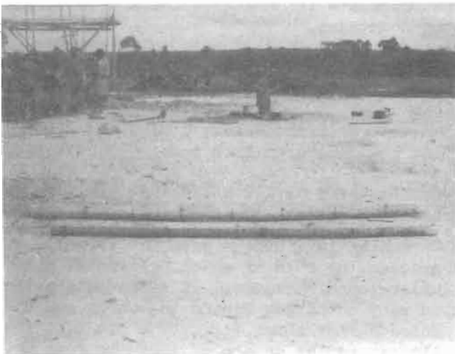
Photograph No. 1 Bamboo Pipe- Four metre length

To improve the strength of the bamboo pipe and to enable it to tolerate high water pressure, the outer surface must be reinforced with galvanized steel or tar bath wire bands knotted at about 5 cm intervals. The end of the pipe section is sharpened into a pencil shape to allow joining by means of a polyethylene socket 15 cm in length. When bamboo is unlined inside has a flow C-value 75 (Hazen Williams) and n-value 0.013 (Manning's). For practical purposes the diameter of bamboo pipes unlined should be slightly larger compared to conventional pipe used for similar purposes e.g. a 7.5 cm bamboo pipe will be necessary where a 5 cm plastic pipe is normally used. For the bamboo pipes lined inside with plastic film or bituminous coatings, the adopted C-value is similar to that in plastic pipes designs. The most commonly used diameters for bamboo pipes are 3.5cm, 5cm, 7.5cm, 9cm, 10cm and 12.5cm (See Photograph No. 1 below).