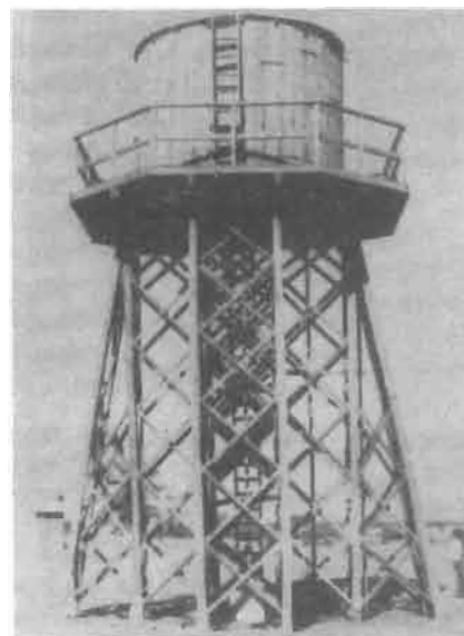
Photograph No. 6 Wooden water storage tank on 8m wooden raiser.