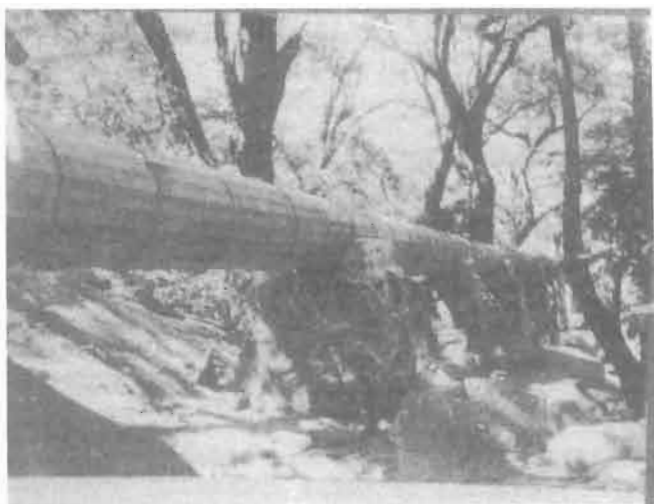
Photograph No.5 Woodstave Pipeline in Operation (60 cm internal diameter).

Construction of wooden Pipes and Tanks is done in the field after delivery of required timber staves and steel bands at the site laying of a wooden pipeline is done by joining timber staves side by side at cross sectional direction while on longitudinal direction timber staves are joined in a stagared manner. For smaller diameter pipes eg. 6.3 cm downward a polythylene socket joint is provided. Wooden Tanks on ground or on wooden raiser are constructed similar to wooden pipes but on vertical direction. (See Photograph No. 5 and No. 6 below).