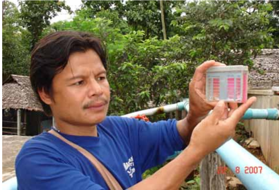
Testing Water for Chlorine Residual in a Refugee Camps in Thailand

Establishing defined roles and responsibilities for each partner in the SWS program is the first step in maintaining good working relationships between all organizations, and assuring program success.