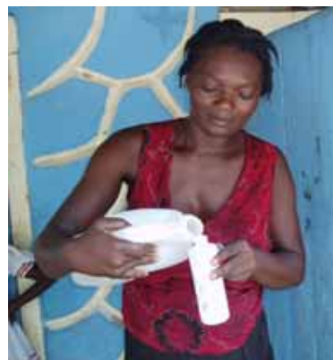
A Reseller Selling Solution

In the third year, the Jolivert program provided assistance to a town 60 km away to start a similar water program. In addition, during the flood of 2005, the program doubled production and distributed free hypochlorite solution for 6 weeks.