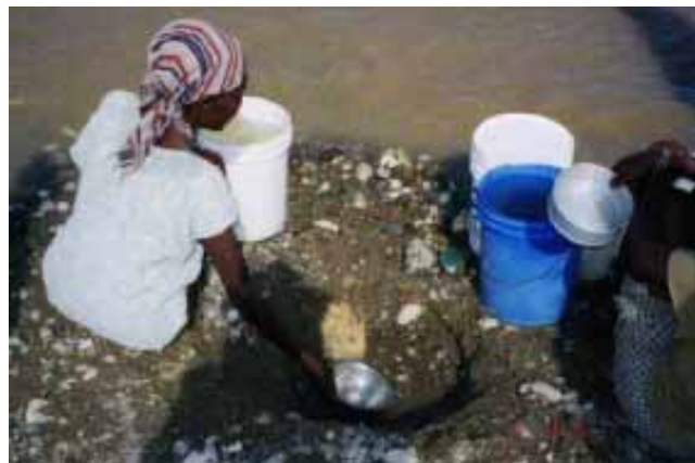
A Woman Filling her Water Container Using Riverbank Filtration after Rainfall

Based on all this information, it was determined that an SWS program was appropriate for the area, and program planning was initiated.