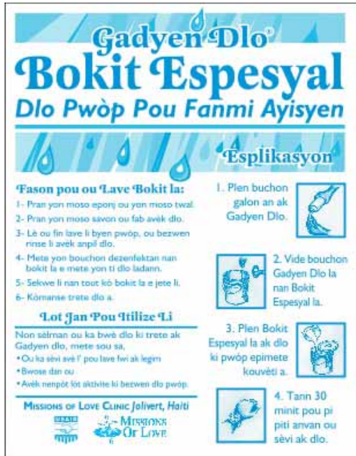
Jolivert Safe Water for Families Bucket Label