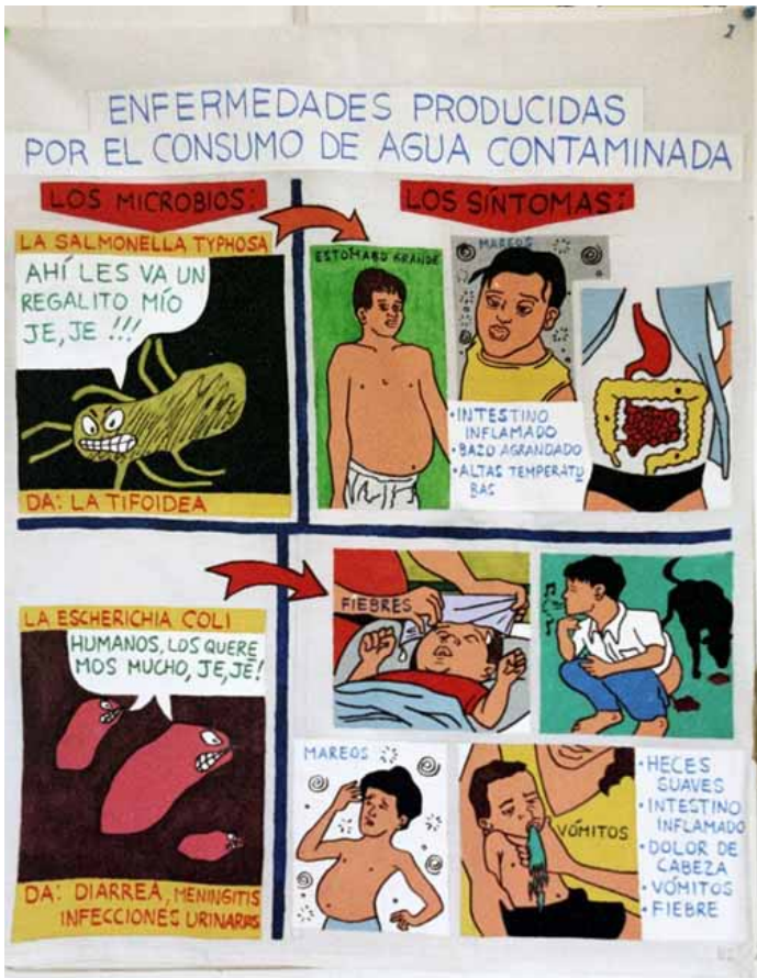
Flip Charts on Causes and Prevention of Diarrhea from Potters for Peace, Nicaragua