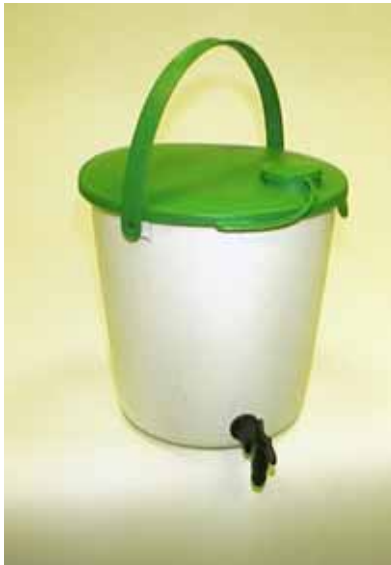
The Oxfam Bucket