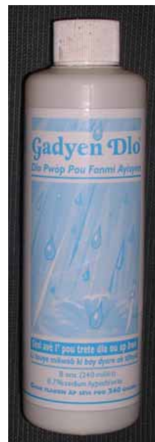
The Jolivert Bottle

The label on the bottle instructs users, through text and illustrations, to add one cap of the solution to the water in the storage container, and wait 30 minutes before drinking. No instructions for double dosing turbid water are on the label because users in the area drink only clear water.