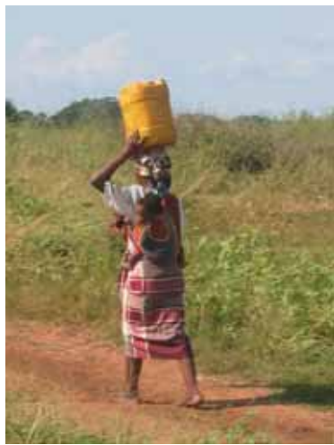
Carrying Water in Mozambique

In many countries in Africa, 20 liter (5 gallon) jerry cans, initially used to transport vegetable cooking oils, are cleaned and used to transport and store water. They are easy to carry on the head, and are a good option for safe storage. The opening is too small to allow hands or utensils into the water, and thus the water is poured out. They can be modified by drilling a hole in the plastic and adding a tap, which offers easier access to the treated water and provides a place to wash hands in the home. Used jerry cans are approximately $1-5 on the open market in Africa.