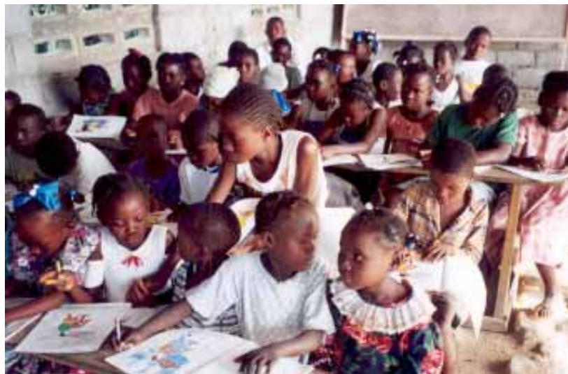
A School in Haiti

After the data collected during the pilot project, the post-pilot survey, and chlorine residual sampling have been assembled; they can be analyzed to develop an expansion plan for the program.