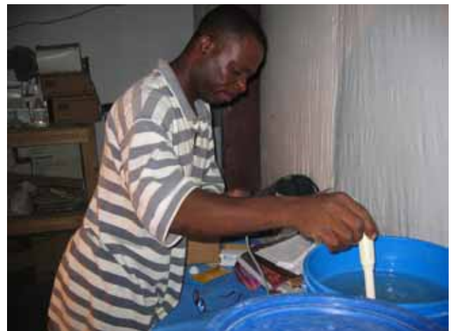
Testing the solution after adjusting the pH to ensure adequate shelf-life