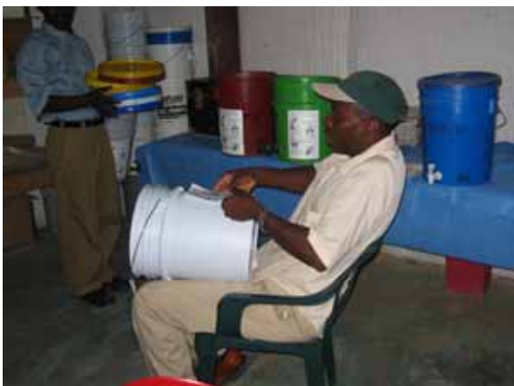
Modifying the Local Bucket