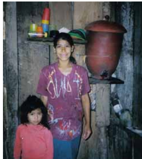
Locally-made Modified Clay Pots in Kenya and Nicaragua