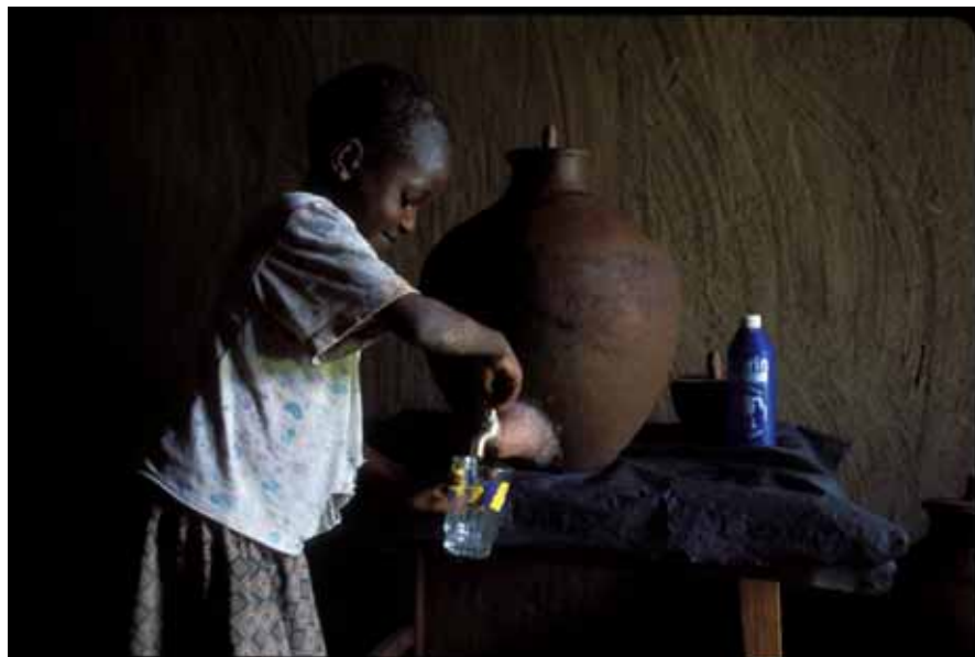
The Safe Water System in Kenya

We wish you the best of luck with your program!