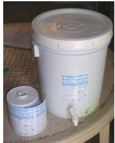
The Jolivert Container

In Haiti, people use 5 gallon (19 liter) paint buckets for water transport and storage. In Jolivert, the buckets are modified for safe storage by ensuring there is a tight-fitting lid, drilling a hole through the plastic and installing a tap, placing a label on the bucket that teaches people how to use the SWS, and teaching people to use the tap instead of dipping into the bucket. In Haiti this is an easy educational message, since the tap is seen as a sign of higher socio-economic status, and families take pride in using the tap. The tap and label are imported from the US at a cost of $0.75 and about $0.60 respectively. Gary Strunak at Tomlinson Industries can be contacted at gstrunak@tomlinsonind.com to purchase the taps.