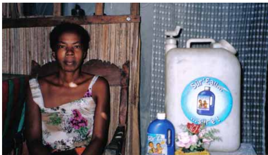
An SWS User in Madagascar

The Safe Water System is an effective, proven intervention that reduces diarrheal disease incidence and is easy for families to use. Please feel free to contact us at safewater@cdc.gov if you have any questions or would like a copy of the SWS handbook. You can also visit our website at www.cdc.gov/safewater for more information.