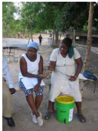
The Jolivert Trainings: Demonstrating Hypochlorite Addition, Distributing the Products