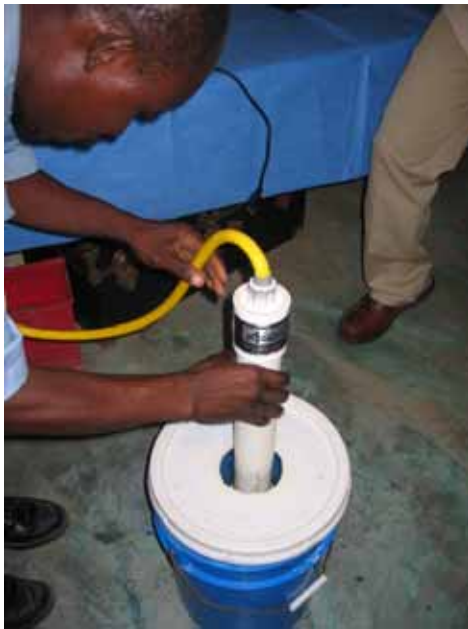
It takes approximately 2 hours to turn 17 liters of brine into 17 liters of hypochlorite solution