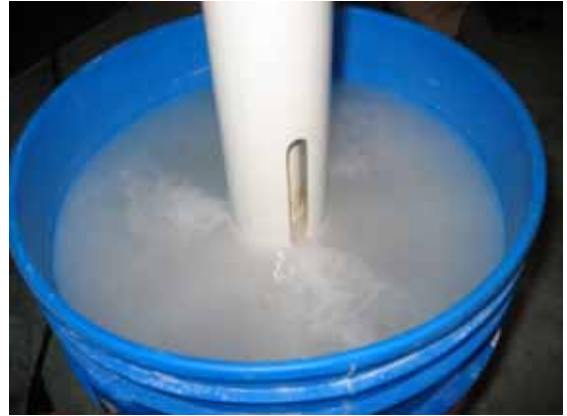
Small bubbles forming during the process