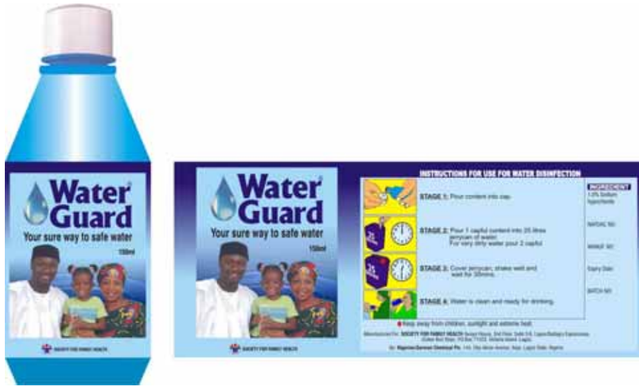
PSI Nigeria Bottle and Label

The PSI/Nigeria label below is an example of a commercially produced label. The Jolivert label below is made on word publishing software and printed and copied onto weatherproof label paper.