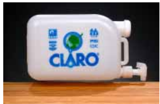
The CDC Bolivia Container

In the initial SWS programs, CDC designed 20-liter modified jerry cans and provided them to users. This jerry can is now produced in Uganda, South Africa, Bolivia, and the United States. The cost of the jerry can is approximately $5 per can, excluding transport. Contact safewater@cdc.gov for ordering information.