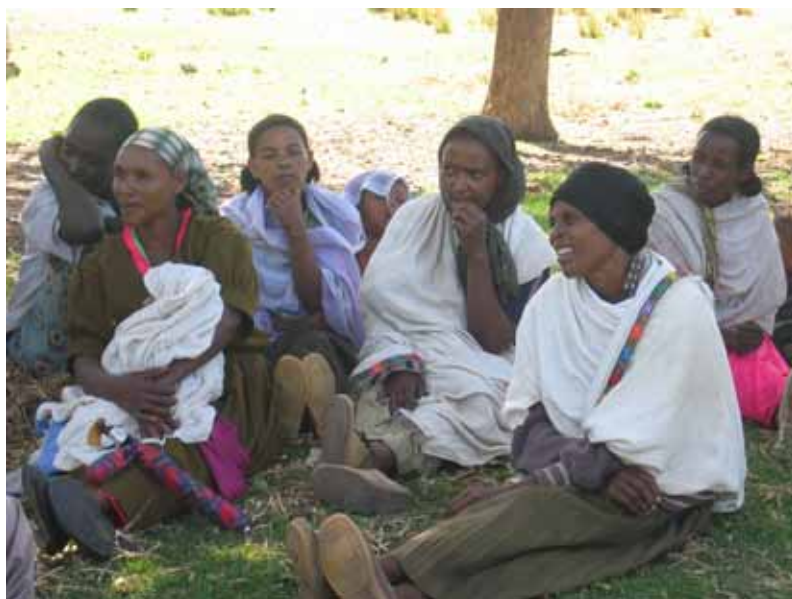
A Focus Group Discussing Water and Sanitation Practices in Ethiopia

After collecting the information detailed in this step, based on community needs, water resources, and organizational capacity, your organization is now able to determine if moving forward with an SWS program is appropriate. This is a decision that should be considered carefully, because providing safe water temporarily in a community will not help the community's long-term development. It is also a decision your organization will need to make for itself. There is no formula that can be applied across all situations to determine if it is appropriate to proceed. The following page details the Jolivert Safe Water for Families experience in determining whether to proceed with an SWS program. If your organization decides to establish an SWS program, the subsequent steps in this manual detail how to start a program.