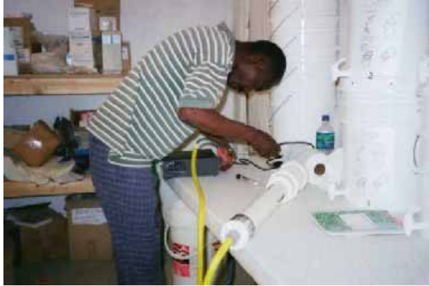
Connecting the probe of the hypochlorite generator to the power supply in preparation for use