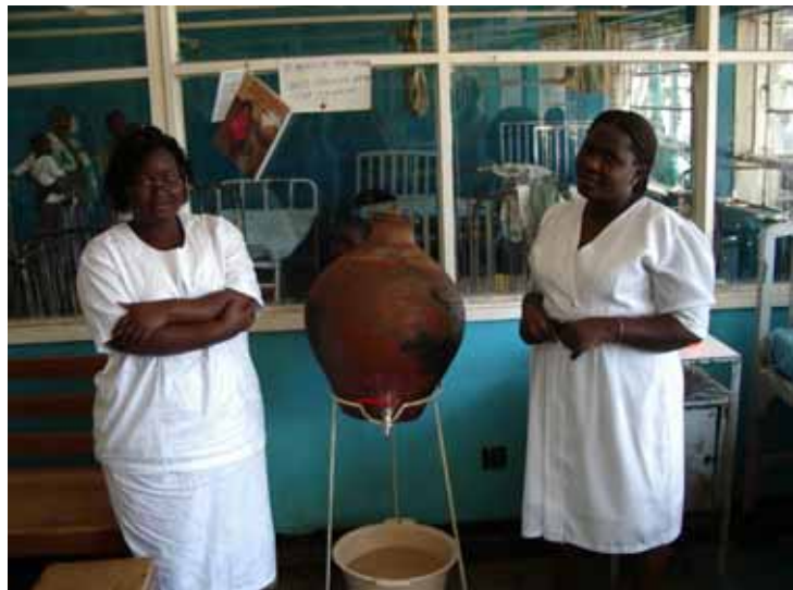
Safe Water and Handwashing Training with Nurses in a Hospital in Kenya

During the pilot project good communication between all program staff is critical to effectively respond to information gained and challenges raised.