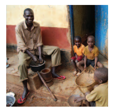
The children of coffee growers help de-husk coffee with their family after school.

contractors, private operators, local government officials and staff from the main water utility experience integrity in the provision of water services. The study would also facilitate development of an updated action plan to address integrity risks. This note describes the key ingredients to putting in place a nationwide good governance action plan in Uganda's water sector, the challenges to be overcome and lessons learned to date. The implications for practice are discussed from the perspectives of policy makers, regulators and ombudsmen, development partners, water service providers and civil society actors. This provides guidance for the replication of best practice by stakeholders in other countries and sectors.