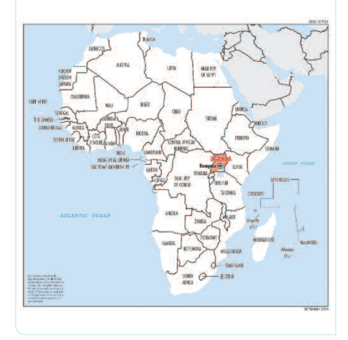
FIGURE 1 Situating Uganda within Africa

Although Uganda is endowed with rich water resources, the delivery of safe water and sanitation to its citizens is hampered in part by poor governance systems and corruption in rural and urban water services (Water and Sanitation Program and the Water Integrity Network, August 2009). Sixty-five per cent of the population has access to safe water in rural areas, although this includes significant regional disparities and dysfunctional water points. Access ranges from as low as 12 per cent in north-eastern Uganda to more than 90 per cent in the south-west. In urban areas, access to safe water stands at 67 per cent. This breaks down to 74 per cent in large towns, which are under the authority of the National Water and Sewerage Corporation (NWSC), and 53 per cent in small towns. (Uganda Water and Environment Sector Performance Report, 2010).