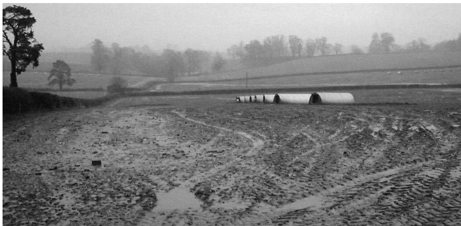
Pig farming often results in significant sediment loading in adjacent watercourses