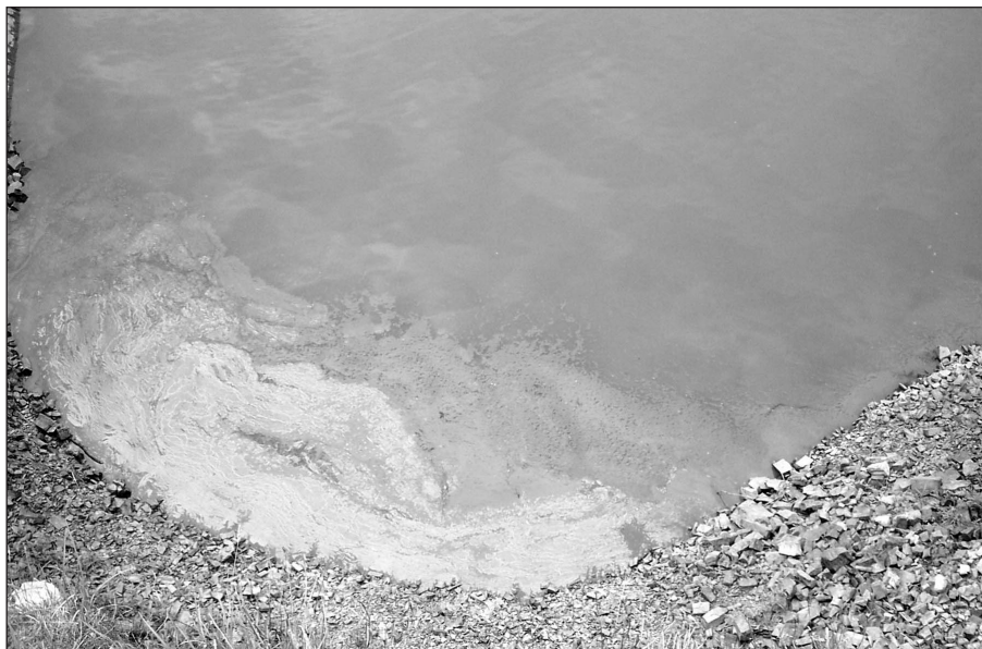
Blue-green algal growth in a drinking-water reservoir – the result of excessive use of fertilizers on agricultural land

In essence, WRT’s methodology involves the adoption of a systematic approach to identifying environmental impacts at a river catchment scale, followed by a practical approach to tackling these impacts at source by engaging with local stakeholders to implement solutions ‘on the ground’ (see Box 1). Importantly, the link between environmental improvements and economic profitability is promoted heavily to facilitate uptake of new ideas and approaches. The methodology is characterized by two key stages: catchment planning and the proactive engagement of stakeholders.