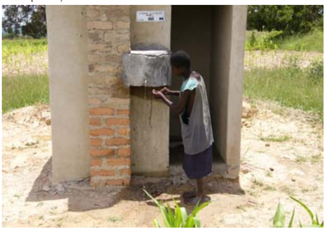
Handwashing promotes personal hygiene

1. Create and strengthen information management systems. The sector must establish its own data bank. At present, the Water and Sanitation sector does not have a strong, well-structured documentation centre to act as a repository of information. It should also house Water and Sanitation sector