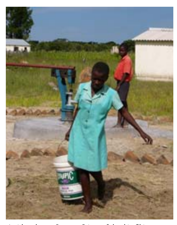
A girl student at Rutunga Primary School in Chirumanzu fetches water from a newly constructed borehole. Besides improving the hygienic standards at the school, the water source is vital for the maintenance of the school nutrition garden which this girl is watering.

While efforts have been channelled towards prevention and ensuring meaningful and positive behaviour change, it must be understood that as long as HIV exists, there will be those who become infected and eventually succumb to AIDS. The progression from infection to full-blown AIDS is usually slow, which means many people may be living with HIV. Numerous materials have been produced to support those people infected with the virus (see Box 6).