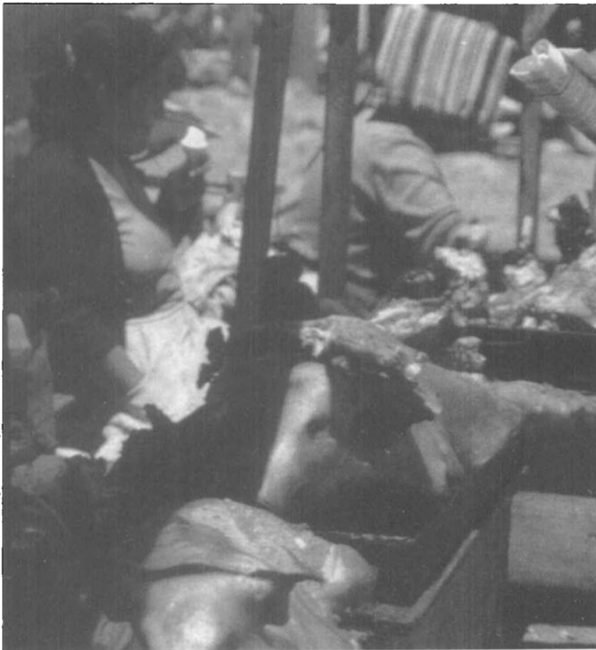
Some foodstuffs may become contaminated during preparation and handling.

Before new water supply and sanitation facilities are built, programmes should aim to make the best possible use of the existing ones.