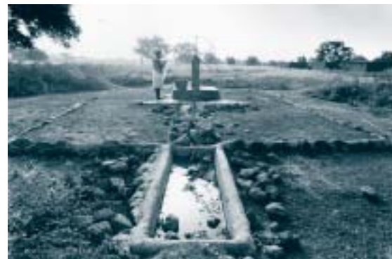
Dedougou, Burkina Faso. Water well built with foreign aid.

The EC's development co-operation has found it helpful in most regions to regroup different kinds of activities, in which water is central or in which water-related investments are important, into four 'Focus Areas'. These address functions rather than technical aspects in isolation: one cross-cutting focus area called "Water resources assessment and planning" (WARP) and three specific societal functions, namely "Basic water supply and sanitation services" (BWSS), particularly in rural and marginal urban areas, "Municipal water and wastewater services" (MWWS), addressing major urban installations and their management, and "Agricultural water use and management" (AWUM).