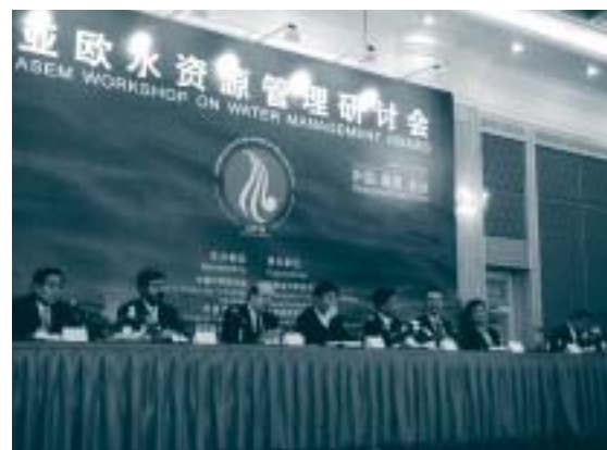
ASEM Workshop on Water Management Issues.

A specific research component has also been established to address the important contribution of research to the achievement of water-related targets. By way of example, the ASEM (Asia-Europe Meetings) water platform is mentioned. Its roots go back to a ministerial meeting in October 1999 in Beijing, when science and technology ministers of the 25 ASEM countries 63 and the European Commission agreed on a list of priorities for intensifying scientific and technological co-operation in areas of joint interest to promote sustainable socio-economic development. Water, forests, aquaculture, sustainable biodiverse food production and clean technologies were among the priorities singled out for immediate follow-up.