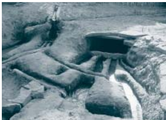
The 'Kasria' of the Ouled Said Oasis in Adrar, Algeria, serves to distribute the waters of the ancient foggara in an equitable way.

We can look at some outstanding achievements in harnessing water resources for food and socio-economic development in history and learn from these to help deal with today's challenges. Among the examples are the 'tanks', small reservoirs impounded by a dam across a seasonally flooded depression, which are still widespread in India and Sri Lanka. These date back to ancient times for enabling irrigated agriculture. An EC development project operating between 1984 and 1996 in Tamil Nadu with a budget of €65.8 million, involved lining the main irrigation and drainage canals and carrying out other essential maintenance work. During a later phase, much more