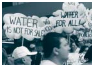
Water figured prominently at the World Social Forum in Porto Alegre, Brazil, in 2003.

An on-going interdisciplinary research co-operation on “Barriers and conditions for the involvement of private capital and enterprise in water supply and sanitation in Latin America and Africa: Seeking economic, social, and environmental sustainability” 30 (PRINWASS) investigates the increased but uneven expansion of private capital investment in the water sector of developing countries. It analyses the existing theories being applied in water improvement programmes in the 1990s underpinning this expansion. Available data suggest that inequality in the access to water and sanitation services in Latin America may have worsened as a result of the highly uneven private investment flows in the sector. These have been concentrated in the wealthiest areas of