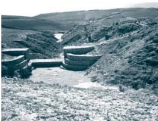
Example of a small dam aiming at reduction of erosion by flash floods, Tunisia.

Receding lake waters left behind ghost towns from what were once fishing communities (commercial fishing ceased in 1982), a saline dust bowl, health problems and uncounted social distress for the 5 million people living in the region around the lake. Numerous research collaborations have analysed the context and continue to provide knowledge for remedial action. Selected projects address some key aspects: "Desertification in the Aral Sea region: A study of the natural and anthropogenic Impacts" (ARAL-KUM) 48 . "Crop irrigation management for combating irrigation induced desertification in the Aral Sea basin" (CIRMAN-ARAL) 49 , focuses on developing strategies for water saving through improved irrigation scheduling and field practices, thus reducing water demand for agriculture, improving control of drainage water and soil and water salinity. "Prevention of land degradation in the Aral Sea region undergoing disastrous desertification by increasing tolerance of symbiotic nitrogen fixation