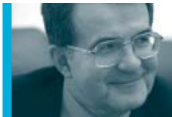
Romano Prodi President of the European Commission