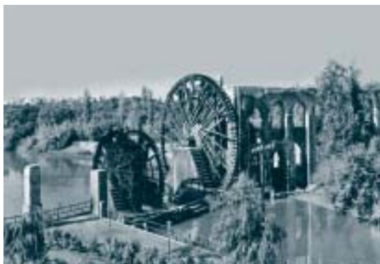
Noria in Hama, Syria, from postcard restored by Aly Abbara.

As early as the fourth millennium BC, the Sumerian civilisation achieved highly productive agriculture on the central Euphrates River floodplain in what is now a desolate region. The surplus generated by the sophisticated irrigation farming then enabled the formation of the first cities and socio-economic specialisation, as confirmed by currently available archaeological evidence. The irrigation required complex social organisation and supported a population growing ten-fold up to an estimated 1 million inhabitants. The Sumerians were also the first to develop a written language, the cuneiform script.