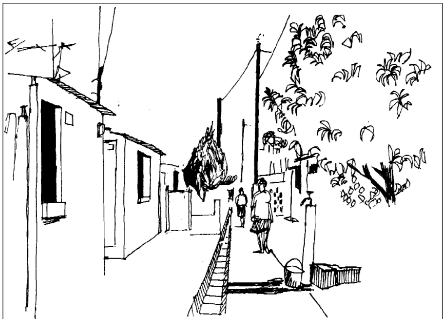
Successful programmes of slum upgrading need wide participation by local people leading to demand-driven solutions

India's efforts at seeking private sector participation (PSP) in urban water supply and wastewater can be divided into two distinct phases. 2 The first phase was approximately from 1994 to 1999, while the second phase was from 2000 to the present. Following liberalization by the Government of India and decentralization efforts, in the mid-nineties there was an unbridled enthusiasm for innovations in the urban sector.