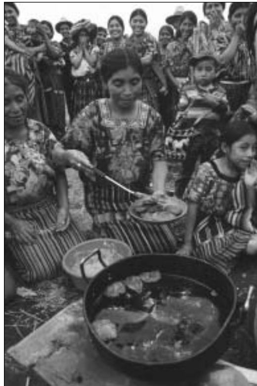
Guatemala

businesses and so on) and citizens have responsibilities in this regard as beneficiaries or agents in producing services. Experience shows that participation by individuals and groups concerned allows appropriate response to people's needs, increases the sense of ownership, and ensures the sustainability of activities. This is particularly true of the participation of women. CIDA has conducted a review of its experience and potential in this area (see Annex III: References).