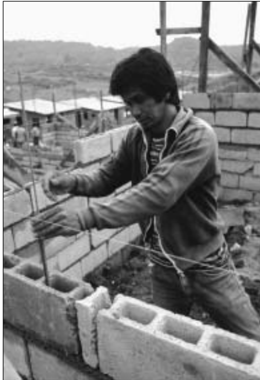
CIDA Photo: David Barbour, Philippines

Good housing conditions are often a basis for health and well-being.