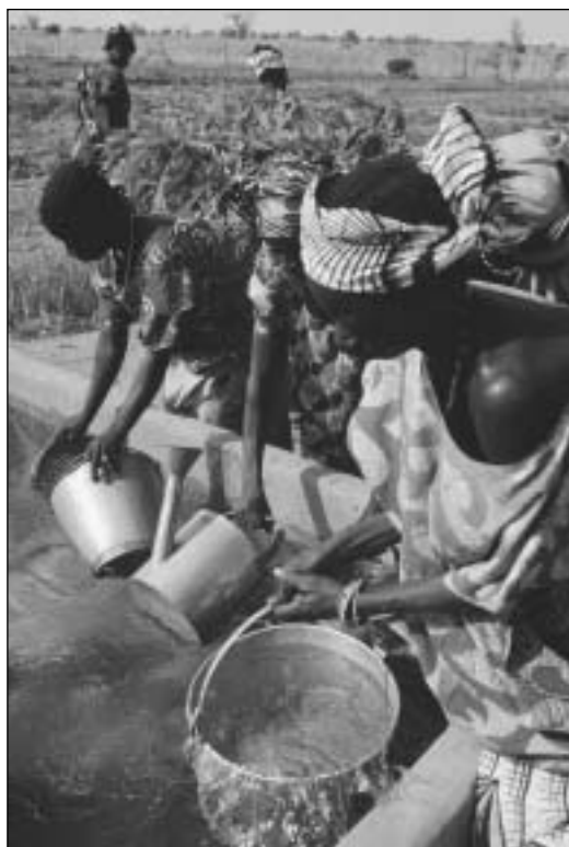
CIDA Photo: Pierre St-Jacques, Mali

Access to water is essential for family needs and food production.