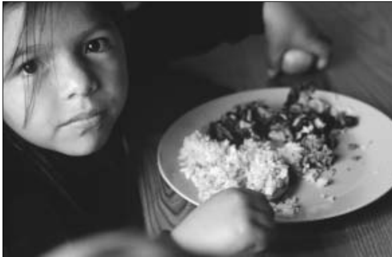
CIDA Photo: Ellen Tolmie, Colombia

Reducing malnutrition among children under five years of age is a key international priority.