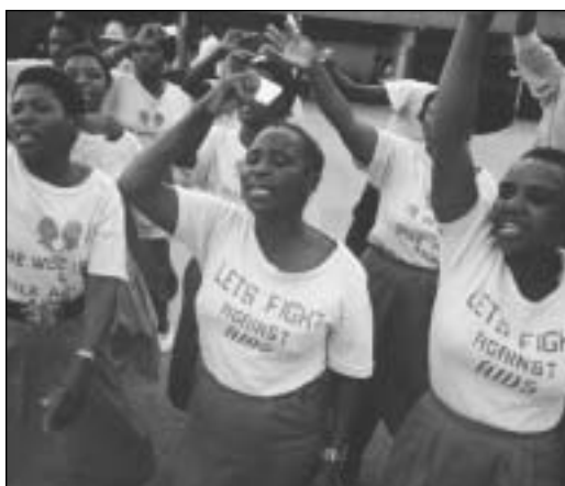
CIDA Photo: David Barbour, Zimbabwe

Social mobilization is important in finding solutions to social problems such as AIDS.