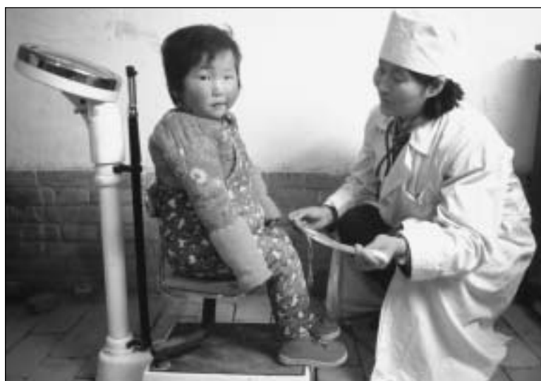
CIDA Photo: Roger Lemoyne, China