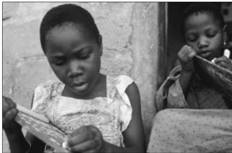
Benin

The education of girls has multiplier effects on health, population and income.