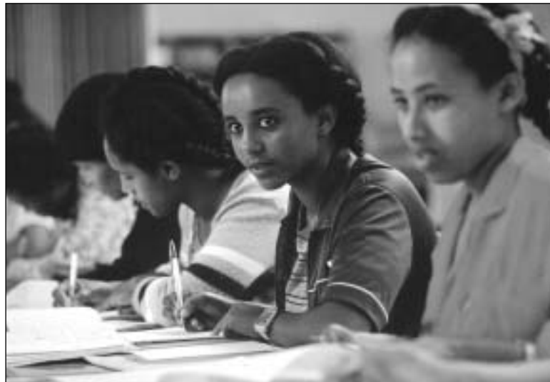
CIDA Photo: David Barbour, Ethiopia