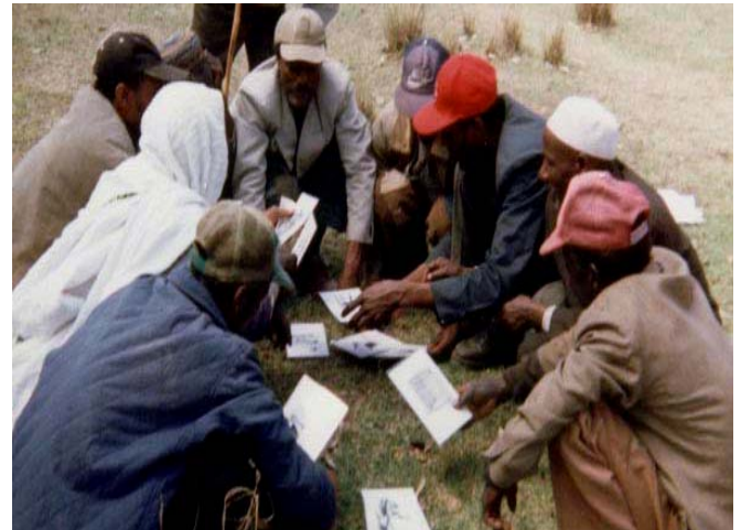
Focus Group Discussion using pictures

Evidence that sanitation problems feature strongly in everyday life can be found in the rich store of proverbs found in Ethiopia's many languages. In a village in Arsi region a solemn meeting of elders was being disturbed by someone moving amongst the crowd. Having enough of this, the elder leading the meeting asked the man: "why do you disturb our meeting like a stool in the dark?" Explanation of this surprising expression revealed the extent of annoyance the restless man was causing: "A stool in the dark spoils the feet, if stepped on. If touched to find out what it is, it spoils the fingers. If fingers are smelt to check further, it spoils the noses".