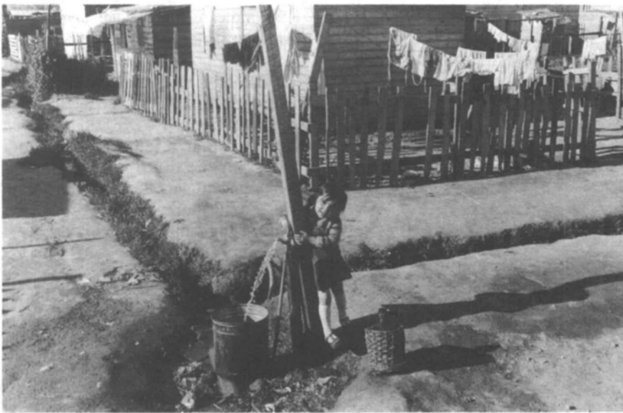
Improvements to water supplies should be seen as a process of social change.

well. New investments had been given priority at the expense of operation and maintenance. An immediate result of the crisis was that funds for new investment were dramatically reduced. In the 1984 budget the social sectors were given less money, and the need for these sectors to become self-sustaining was emphasized. Major donors such as the World Bank and USAID withdrew from planned regional water supply programmes, leaving the dry central part of the country without external financial sources. Bilateral donors — notably Nordic and Dutch — concentrated their resources on area programmes which covered one or more regions.