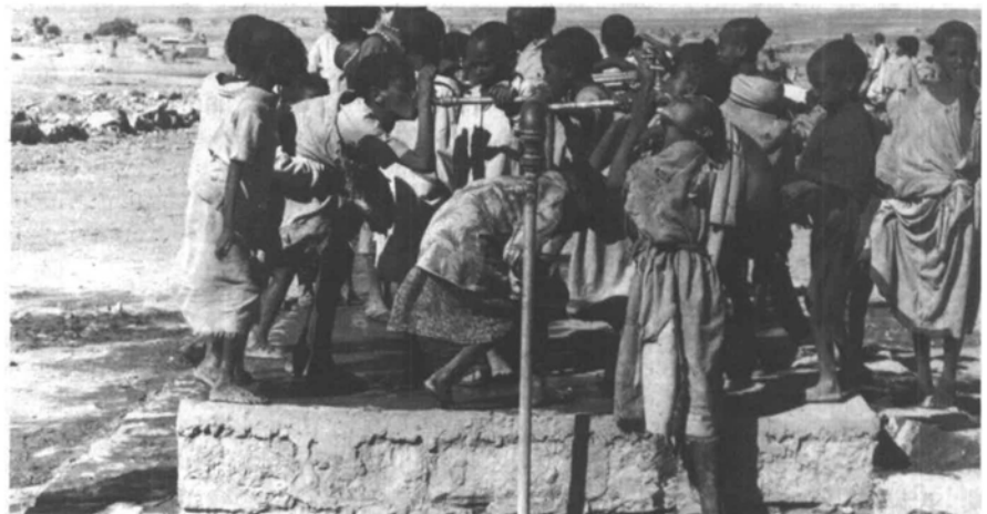
Social sector programmes are vital ingredients for social developments.

1985 indicate that 42 per cent of the rural population have access to 'adequate potable water', but poor functioning is said to reduce this figure to 25 per cent. Experience from the regions supported by SIDA, however, indicates that often only the water supply in the district headquarters functions with any degree of reliability and thus a more realistic figure for many regions may be as low as 5 per cent.