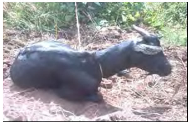
Households with no latrines had to surrender two goats to the police