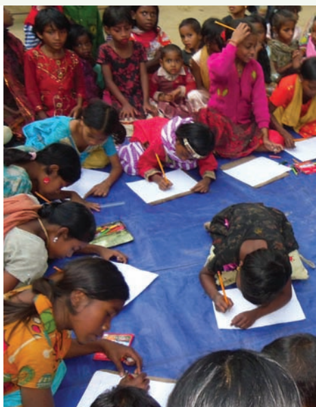
Figure 4 Children with their WASH-related drawings WaterAid in Bangladesh