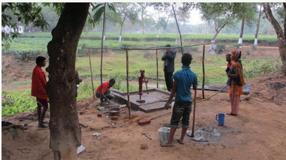
Figure 6 Disability accessible tubewell installation in tea pickers' community WaterAid in Bangladesh

these services keeping in mind the effectiveness of learning by playing.