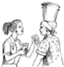
Training can be provided for householders

In addition, the provision of effective, efficient, affordable, economical and sustainable water and sanitation services promotes community development in general. A healthy, productive community is better able to deal with the challenges of HIV/AIDS.