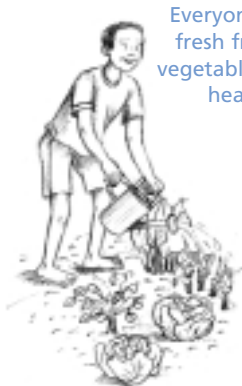
Everyone needs fresh fruit and vegetables to stay healthy.