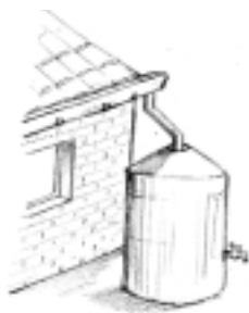
Simple additions to infrastructure can help people to save water.