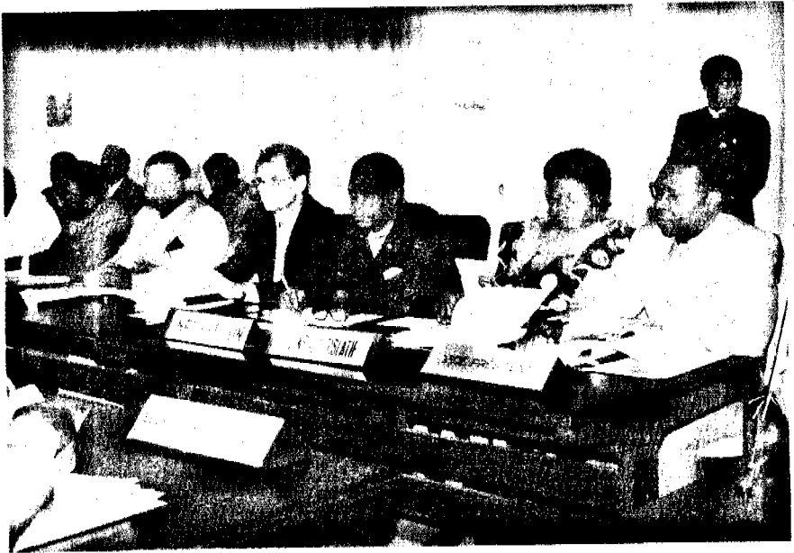
National action meeting, July 1988

The second part defines particular strategies for the different subsectors : Water Supply both in the Urban and Rural areas and Sanitation in the Urban and Rural areas.