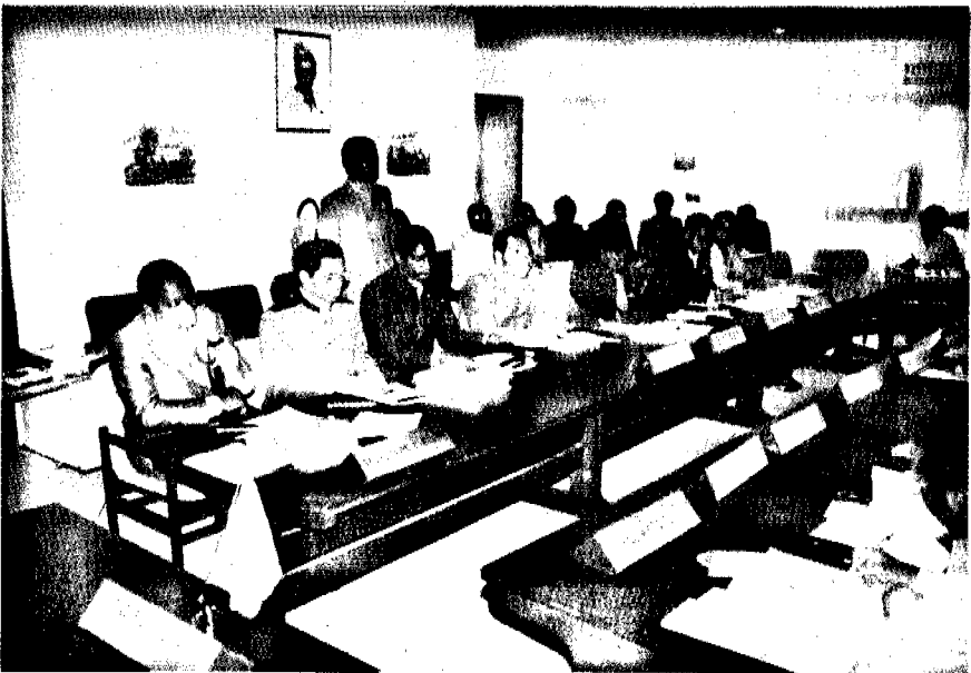
National action meeting, July 1988